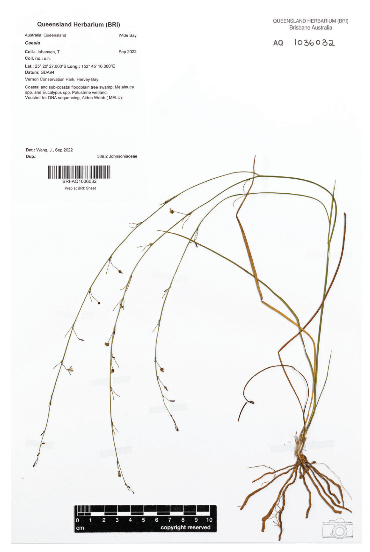
Figure 2. Holotype of Caesia walalbai from Vernon Conservation Reserve, Hervey Bay, Queensland ( T. Johansen s.n. ; BRI AQ1036032).