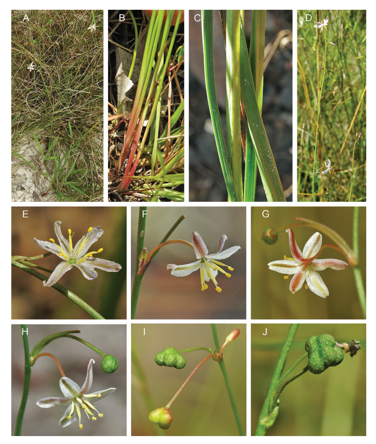
Figure 1. Caesia walalbai from Hervey Bay, Maryborough and near Talegalla Weir, Tuan State Forest, Queensland, Australia. A. Habit; B. Leaf sheath; C. Leaf lamina; D. Inflorescence; E–H. Flowers showing pedicels depicting yellow filaments and long, recurved pedicels; I, J. Mature and developing (centre) capsules.

lowest branch linear–lanceolate, (5-)20-50(-100) mm long, > 3× length of upper bracts subtending flower clusters; upper bracts subulate or lanceolate, 1.5–3 mm long, green to brown. Pedicels (6–)10–20(–30) mm long, slender, often recurved, red or green. Flowers pedicellate, erect to pendulous. Perianth segments 6, 4–6 mm long, narrowly elliptic, thin, spreading to recurved, two-toned in colour. Outer whorl white or pale pink to redbrown with subterminal, short, reflexed, apical trichomes, inner whorl white to cream, both whorls with green to brown nerves and obtuse apices, segments twist following anthesis. Stamens 6, equal, 2–3 mm long, epitepalous, attached slightly above tepal base; filaments fusiform, yellow with clear apex; anthers c . 0.5 mm long, yellow, dorsifixed, versatile. Ovary green, ± spheroidal, smooth, 3-locular; ovules 2 per locule; placentation axile; style simple, filiform, of similar length to stamens; stigma minutely capitate. Capsules 3–6 mm wide, surface often with irregular, rounded projections, tripartite, loculicidual, 1 or 2 seeds developing per locule, green. Seeds 1.3–2 mm wide; testa dull black, granular with sparse, irregular tubercles; aril papery, not sheathing seed. (Figs 1 & 2)