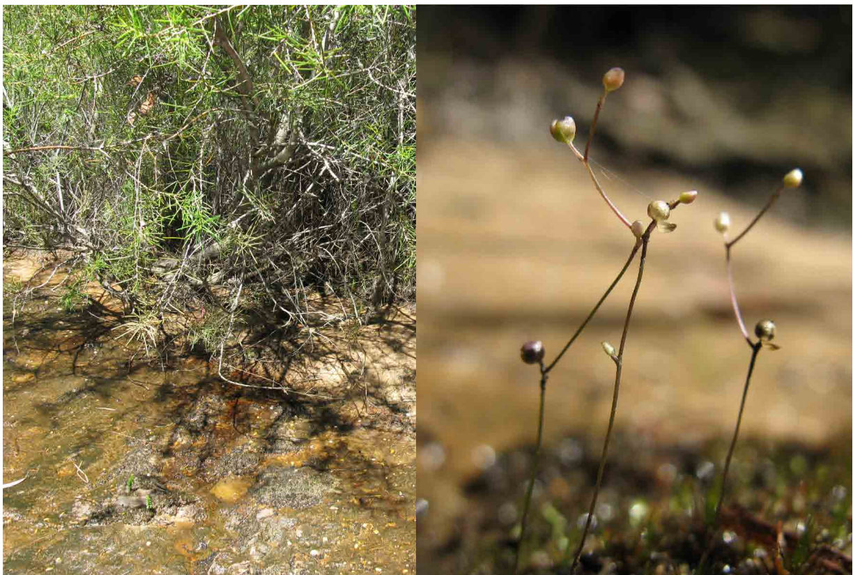
Fig. 2. Utricularia subulata . a , riparian habitat, Royal National Park, Sydney (Central Coast); b , 'zig-zag' habit of inflorescences (cleistogamous flowers).

Distribution : Pantropical: Australia, native to Queensland and Northern Territory; introduced in New South Wales, Central Coast, Royal National Park ( Ciric 4; Jobson 1355, 1409), and South Coast, Morton National Park, Porters Creek Dam, c.16 km W of Yatte Yattah ( Jobson 1359). The extent of the distribution and habitat preferences of this species are inadequately known, largely because only 19 other naturally occurring specimens are known from herbarium collections.