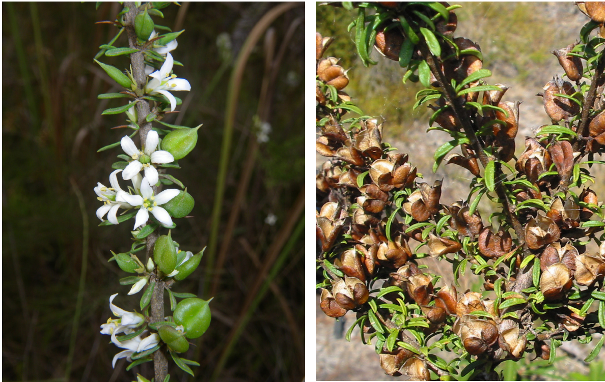
Fig. 2. Bursaria cayzeriae . A. branchlet showing flowers and young fruit, Tucabia, N.S.W., Copeland 2513 & Edwards; B. habit showing dehiscent capsules, Rocky Creek, N.S.W., Copeland 3780.