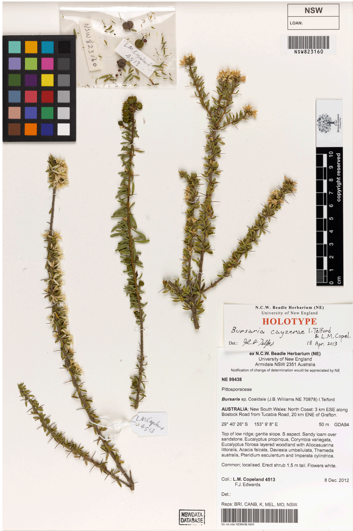
Fig. 1. Holotype of Bursaria cayzerae I.Telford & L.M.Copel. (NSW823160).