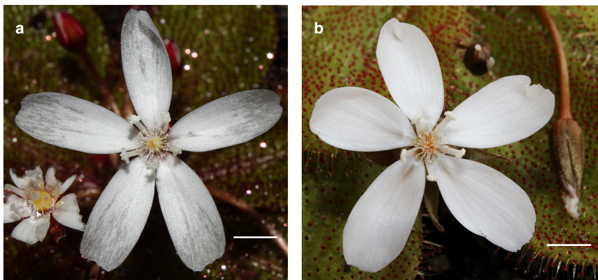
Fig. 1. Open flowers of a , D. bulbosa subsp. bulbosa and b , D. bulbosa subsp. major that show the flowers have white pollen and capitate styles that form a hemispherical dome around the apex of the ovary. Scale bar: a & b = 5mm.

Affinities: Based on leaf shape, leaves with a prominent raised midrib, flowers held singularly on their own pedicles and capitate stigmas, and preliminary molecular data this taxon is most closely allied to Drosera bulbosa subsp. bulbosa and D. bulbosa subsp. major . It is intermediate in size between these two subspecies and due to its pollen colour and the absence of style segments from the apex of the ovary it is hereby considered to be another subspecies of D. bulbosa . Subspecific rank appears appropriate due to the similar leaf morphology of the three subspecies, all with their prominent raised midrib on the adaxial surface, and also the similarity of molecular sequences (unpublished data, not present here). Characteristic features of these subspecies are provided in Table 1 below. The type collection for D. bulbosa subsp. major was made near the town of Mingenew