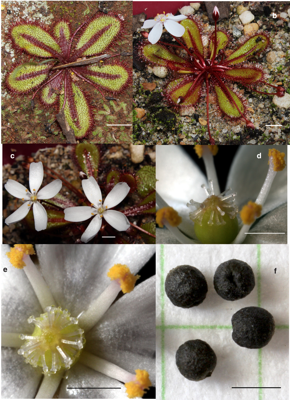
Fig. 3. Drosera bulbosa subsp. coronata : a , sterile rosette of leaves in situ; b , flowering plant (in cultivation); c , details of two flowers; d , details of stamens and ovary angled ventral view, showing naked apex of ovary above the annulus of styles and stamens with yellow pollen; e , details of centre of flower, ventral view; f , mature seeds (grid lines are 2 mm apart). Scale bar: a , b = 5 mm; c = 5 mm; d , e , & f = 1 mm.