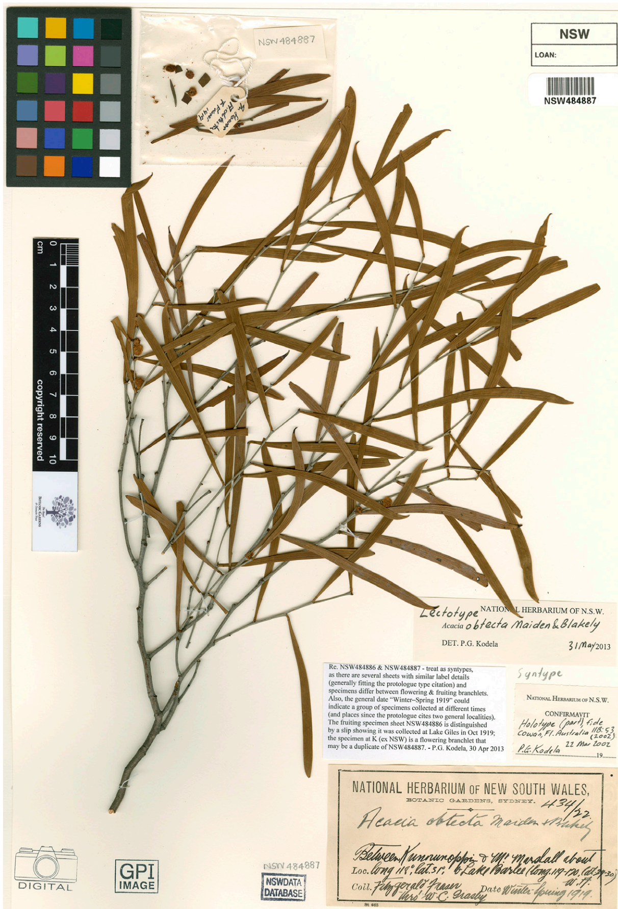
Fig. 3. Lectotype of Acacia obtecta Maiden & Blakely, NSW484887