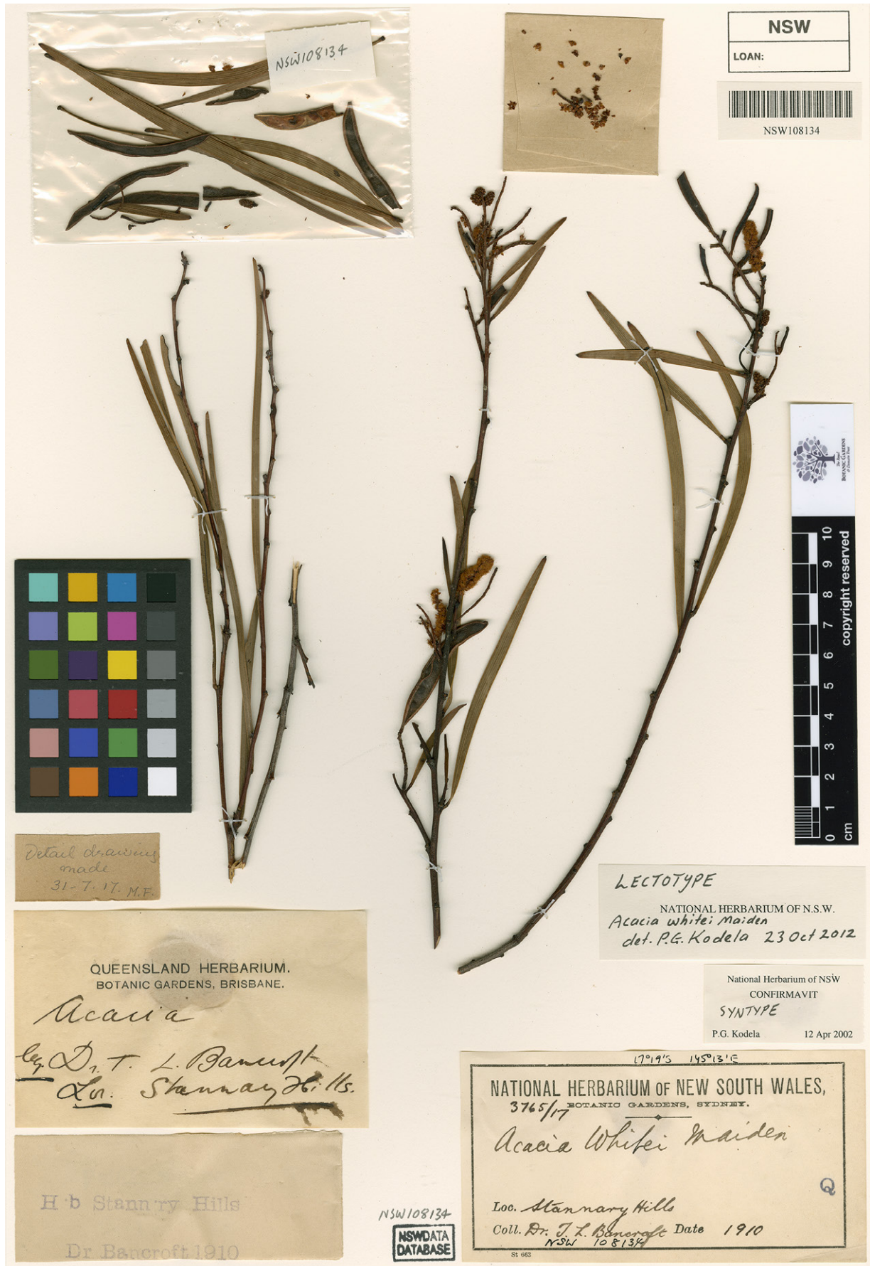
Fig. 6. Lectotype of Acacia whitei Maiden, NSW108134