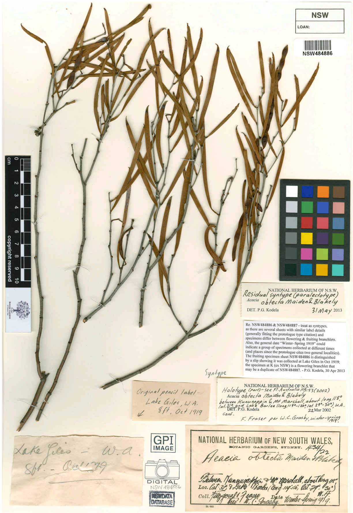
Fig. 4. Residual syntype of Acacia obtecta Maiden & Blakely, NSW484886