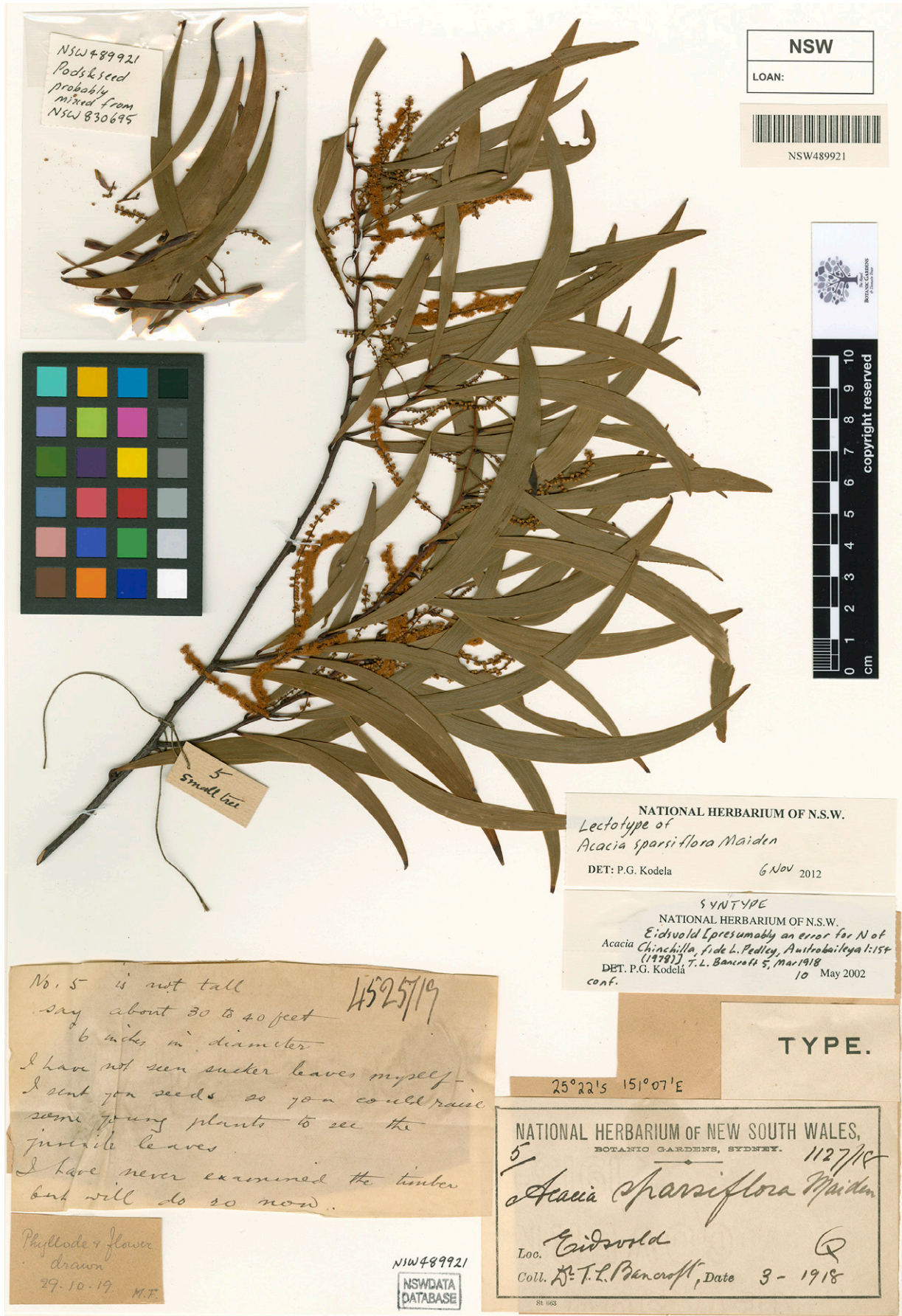
Fig. 5. Lectotype of Acacia sparsiflora Maiden, NSW489921