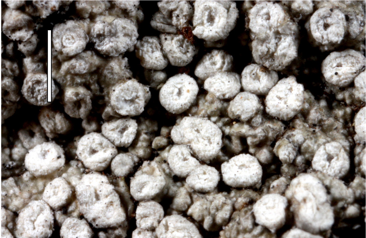
Fig. 1 Pertusaria elizabethae A.W.Archer & Elix, holotype; bar = 1 mm