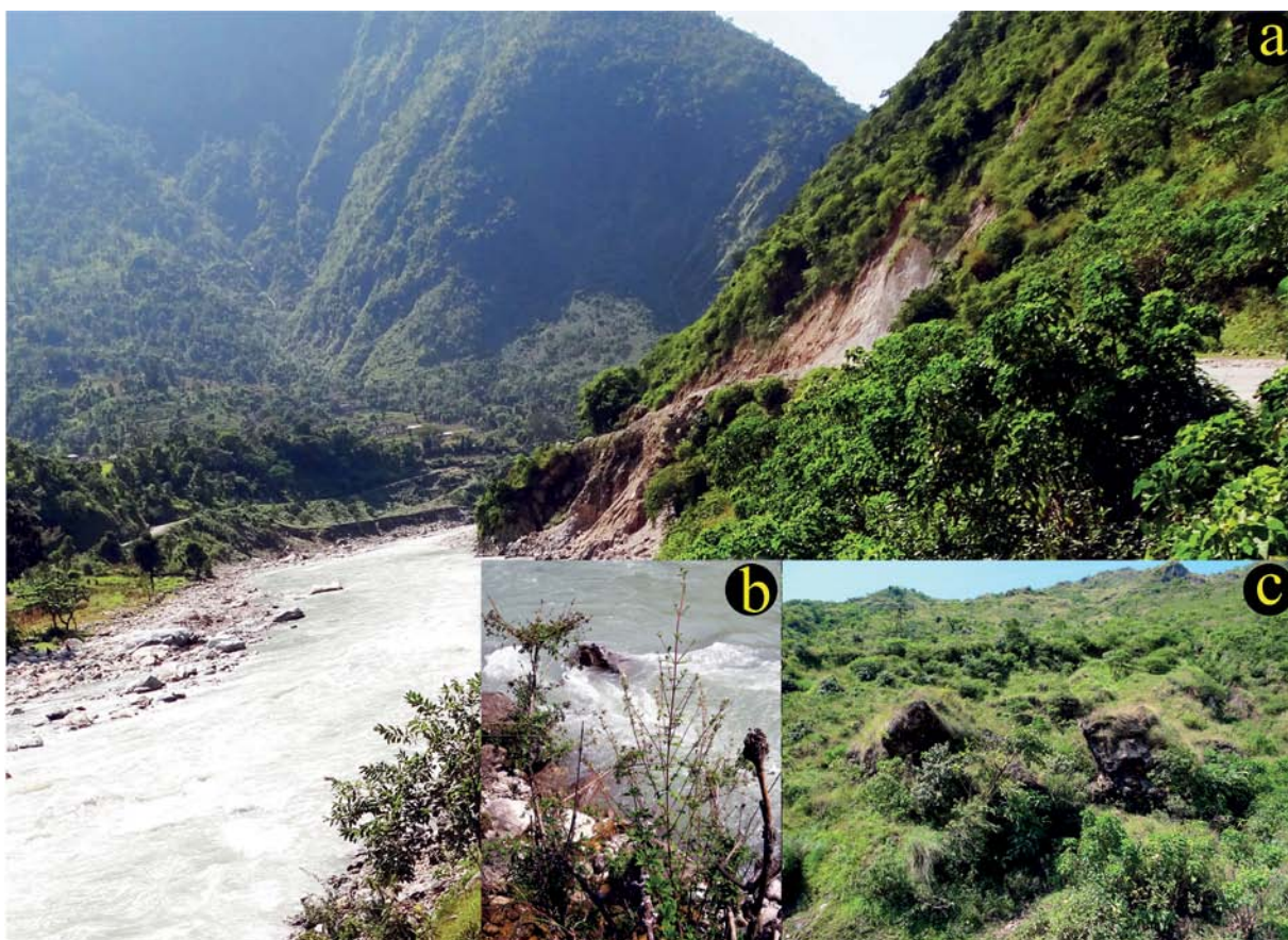
Fig. 2. Leptodermis riparia : a. type locality near Balwakot along the bank of Kali river (Nepal in the far left of the photograph); b. riparian habit; c. habitat on rocky slopes.