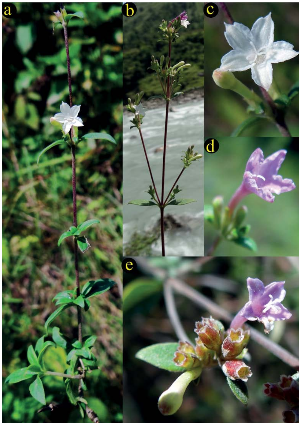
Fig. 3. Leptodermis riparia : a and b. Flowering branches; c. flower showing styles and pilose surface inside; d. mature flower; e. flower bud, mature flower and fruits.

Distribution in Western Himalaya: Balwakot (29°48'8.69" N, 80°27'11.63" E, 725 m); Bungachhina (29°41'52.78" N, 80°11'42.22" E, 1460 m); Dungrakot (Wadda) (29°31'53.45" N, 80°18'40.83" E, 1525 m) in Pithoragarh district, Uttarakhand.