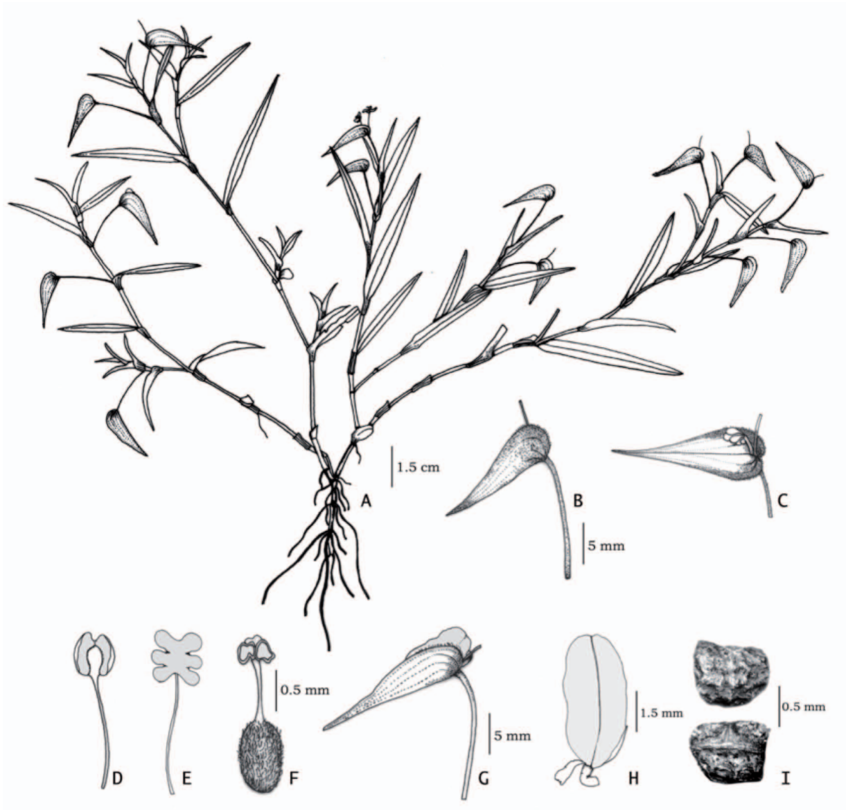
Fig. 1. Commelina badamica A. habit, B & C. flowering spathes (abaxial and adaxial view respectively), D. stamen, E. staminode, F. pistil, G. fruiting spathe, H. capsule, I. seeds (dorsal surface (above) and ventral surface (below)). A-I from Nandikar 0238 (SUK). Scale shown on figure. Illustrator: M.D. Nandikar