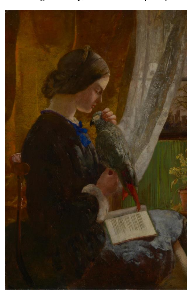
Fig. 2. Walter Howell Deverell. The Pet Parrot (The Grey Parrot) . c.1852-53. Oil on canvas, 53.5 by 35.2 cm. (National Gallery of Victoria, Melbourne).

Settling into this new environment, and as new people entered his circle, Deverell explored fresh subject matter that included scenes from everyday life. He began three compositions, all with the same model, set at Heathfield House. An oil study for The Pet Parrot: a Sketch (unlocated) appeared at the exhibition of the North of England Society for the Promotion of the Fine Arts in