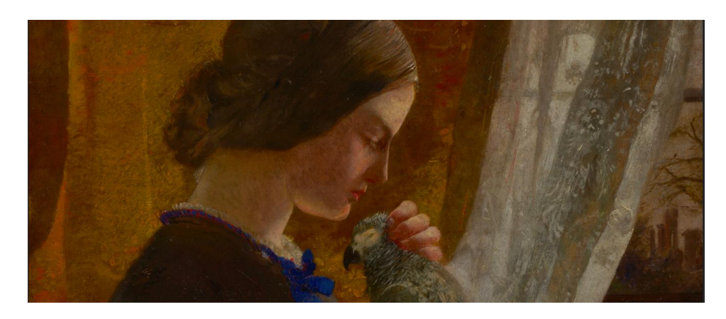
Detail from Fig 2. Walter Howell Deverell. The Pet Parrot. c.1852-53.

In 2015 the National Gallery of Victoria staged a two-day symposium to coincide with their exhibition Medieval Moderns: The Pre-Raphaelite Brotherhood . In my keynote lecture, "The People behind the Portraits in Australia's Pre-Raphaelite Collections," I examined the links between the image in the work of art and the actual individual portrayed, while also developing the theme of the crossover between portraiture and subject painting in Pre-Raphaelite art. From the founding of the Brotherhood in 1848, this group of young British artists ignited new possibilities in all genres of art, not least portraiture. The formal portrait mutated into a more direct vision of a real person, while subject paintings gained new meanings as artists cast family and friends in new roles, bringing into question the wider issue of identity. I argue in this paper that Walter Howell Deverell's The Pet Parrot (1853), a painting in the collection of the National Gallery of Victoria, exemplifies this aspect of Pre-Raphaelite art.<sup>2</sup>