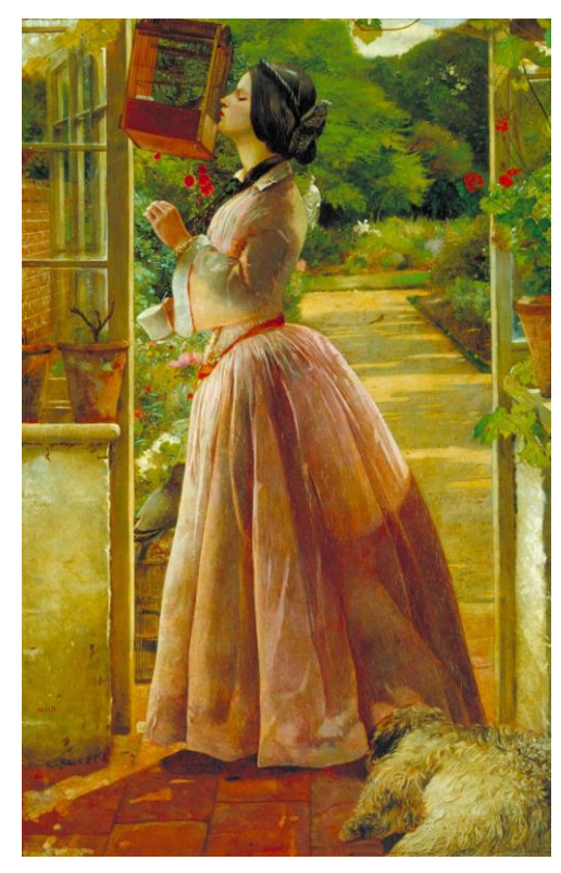
Fig. 4. Walter Howell Deverell. A Pet. c.1853. Oil on canvas, 83.8 by 57.1 cm. (Tate Gallery, London).

field House, with its carefully planted borders in full flower on a splendid summer day, contrasting with the interior of the conservatory with a vine, flowering geranium and two other potted plants. Such is the setting, but Deverell depicted his sitter in conjunction with pets of various kinds including a fluffy white dog sleeping at her feet. Echoing the subject of The Pet Parrot, in this painting a variety of birds are on display. Eustatia leans toward a caged one; a dove or pigeon sits on its birdcage just outside the door; another is situated on the path and one is perched on a wall to the left. All are free except the one the sitter communicates with, setting up the parallel between confinement and freedom, which is also reflected in the title A Pet. Who is the pet? In the third painting, Eustatia (Fig. 3), the figure, dressed in black, stands just outside the same conservatory door. This severe