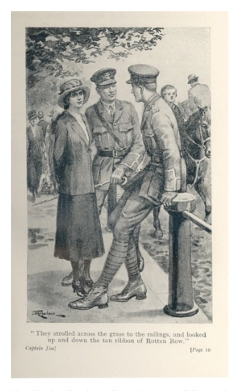
Figure 3 - Mary Grant Bruce, Captain Jim (London, Melbourne, Toronto: Ward, Lock and Co., 1919) 16.

woven into narratives of war. In this illustration demure Norah appears a passive antithesis to her familiar role as an independent and spirited action figure. However, when viewed from Schaffer's Lacanian perspective, and the role of colonial women and girls in consolidating myths of war, the symbolic arrangement of the key characters suggests something different. In signalling moral support, gendered mateship and "egalitarian ethic" (Denoon et al. 271), MacFarlane's oval arrangement reaffirms the critical role of the "help-meet" or "help-mate," as she was called in New Zealand, as vital to the construction of the independent Anzac ideal as she was to nation building. MacFarlane's representation of "little mate" as having reached adulthood, and her girlhood companions as having survived the hostilities, is subsequently a piece of political rhetoric and positions the heroine as being at one with and hence equal to the men.