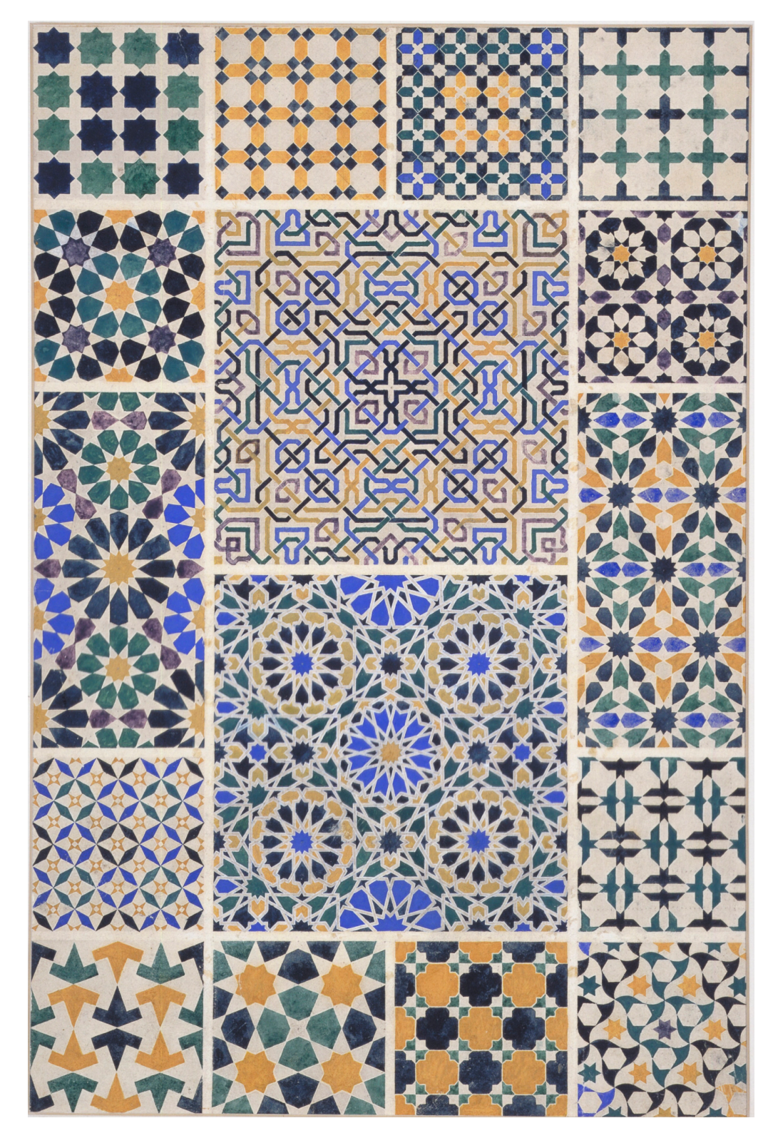
Figure 2: Owen Jones, Original drawing for 'The Grammar of Ornament'; Plate XL, Moresque No. 2 (Drawing), published 1856. Prints, Drawing and Paintings Collection, Victoria and Albert Museum, London