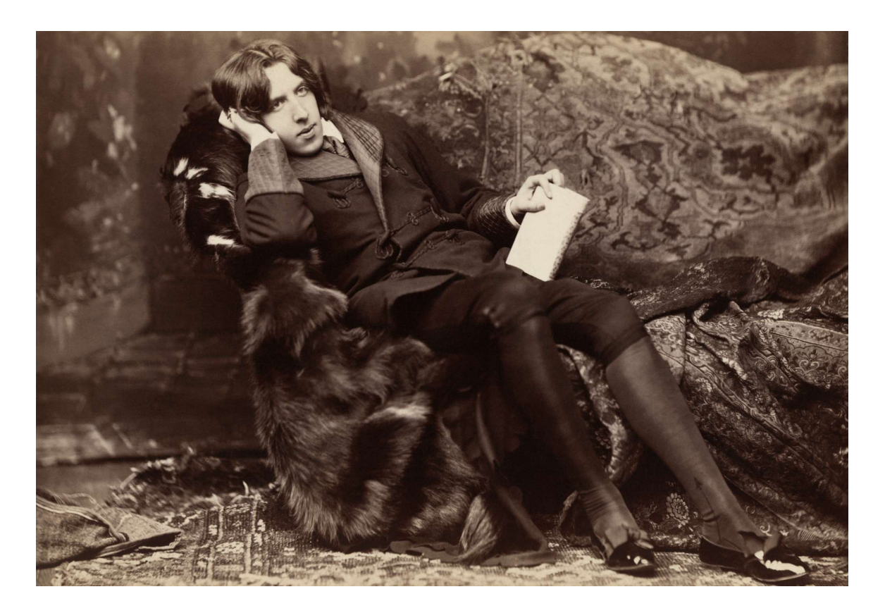
Figure 1: Oscar Wilde, New York 1882 by Napoleon Sarony.

which Wilde would go on to equate with the critical temperament and cosmopolitanism, has received little attention.