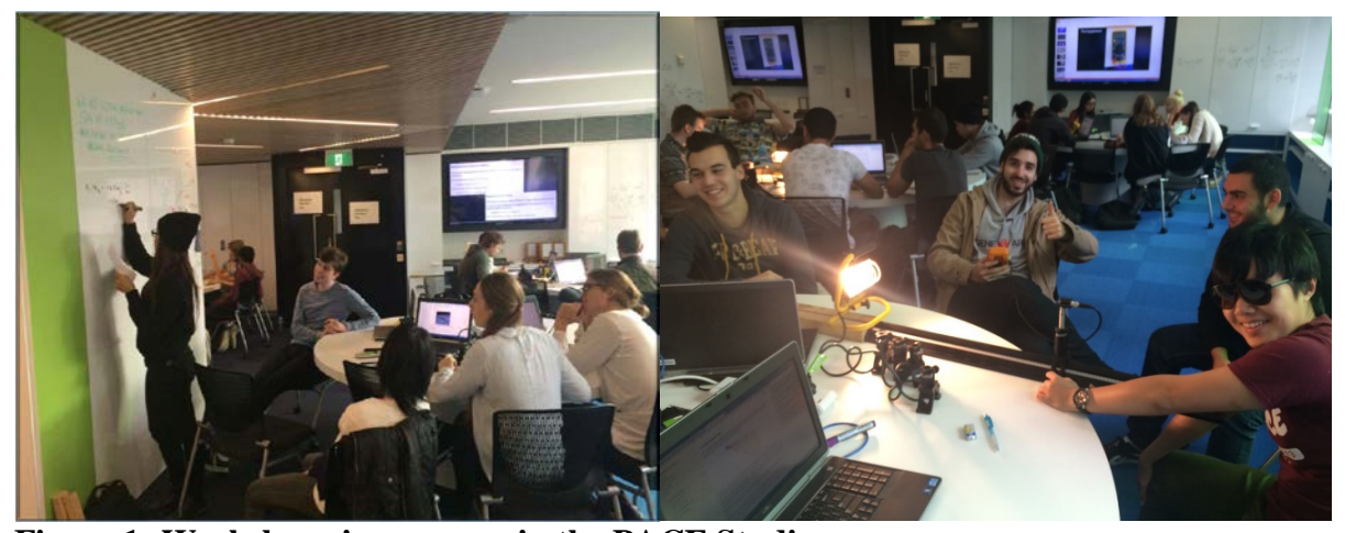
Figure 1: Workshops in progress in the PACE Studios

Our learner-centred pedagogical approach aligns with that of SCALE UP, and is a blend of lecture and laboratory instructions. This approach minimises passive lecturing, instead using a more engaging instructional approach drawing on a variety of education research (e.g. Beichner 2008). The result is an environment where students can work cooperatively and learn from peer discussions and guidance from their instructors.