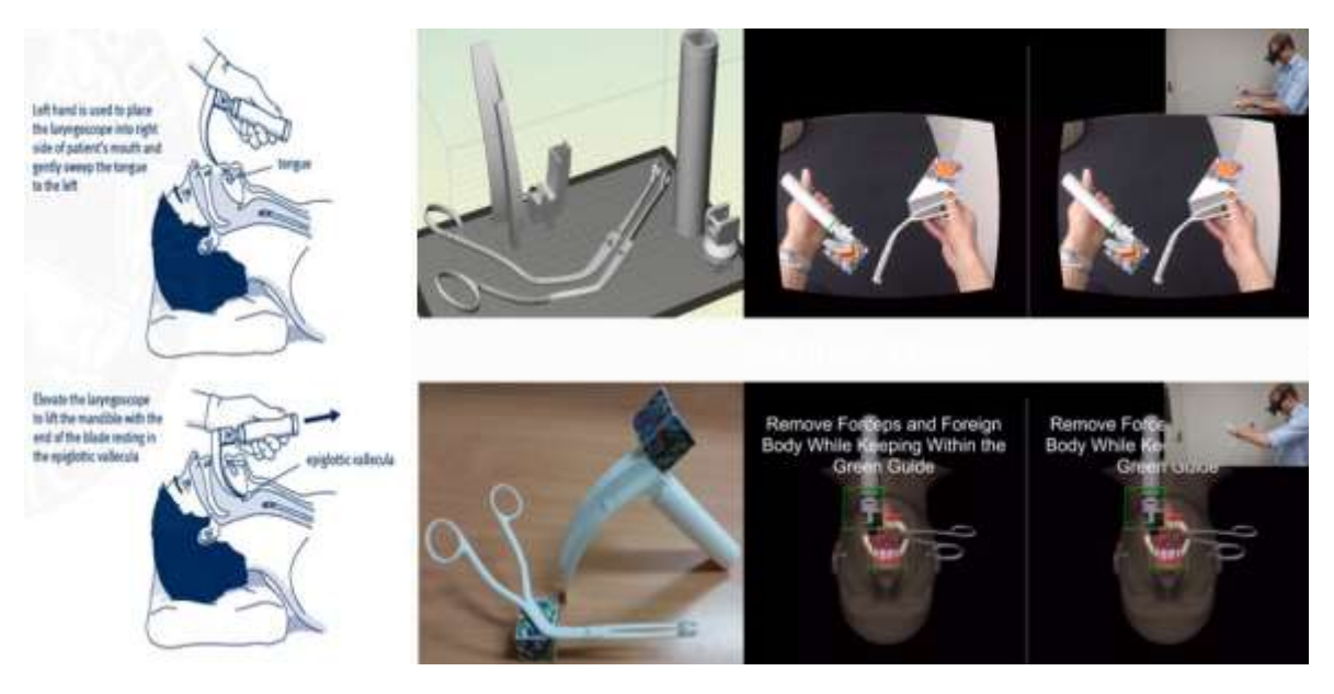
Figure 4: Steps to perform laryngoscopy for foreign body removal shown are traditional 2d images and the mixed reality visualisation using 3d printed objects and a AR/VR mobile application

The focus of the simulation to be task appropriate means that only pertinent information relating to the key learning outcomes was to be included. To this end, a tutorial was provided explaining to the student how to hold the instruments and use the simulation through both text and audio cues. First, all markers need to be identified by the camera through a process of image recognition. Then, the virtual objects are recognized within the mobile phone/camera view of the actual physical tools. That indicates to the user that the simulation seen on their phone has 'recognized' the markers and makes them more confident to use the tool to practice their skills.