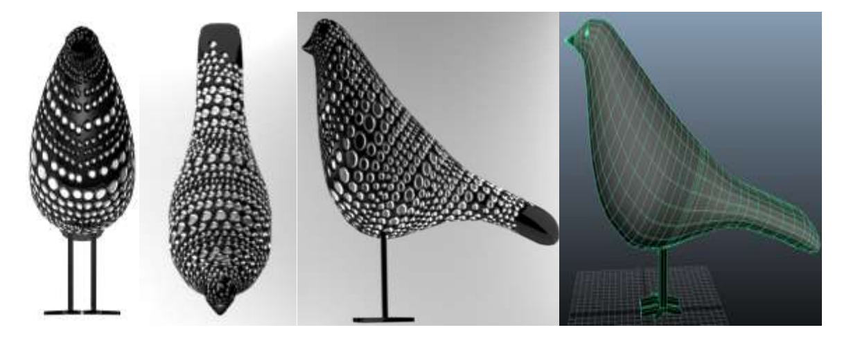
Figure 2: Traditional 2d reference image of a bird statue shown on the left; Student Maya 3d polygon example shown on the right

For the architecture classroom, as in the multimedia study, learners were given a series of comparative exercises with two forms of media (2d projections, 3d printed scale models, full scale built environments and 3d VR environments). They were asked to compare and contrast the different media, including the information gleaned from each separately, the difficulty or ease with which the media facilitates accurate interpretation, and ultimately their preference for each exercise. These analyses were provided through reflected blogs (see Figure 3 for an illustrative example of the human scale objective). Results of these blogs are presented in Birt, Hovorka and Nelson (2015) and Birt, Nelson and Hovorka (2015) with summaries presented in the results section of this paper.