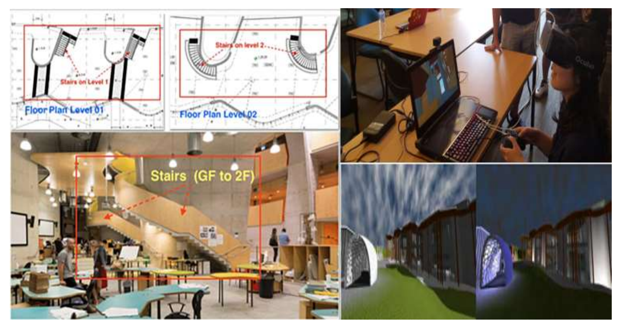
Figure 3: Designing/representing a staircase - 2d traditional view, physical build environment and VR learning artefacts

For the architecture classroom, as in the multimedia study, learners were given a series of comparative exercises with two forms of media (2d projections, 3d printed scale models, full scale built environments and 3d VR environments). They were asked to compare and contrast the different media, including the information gleaned from each separately, the difficulty or ease with which the media facilitates accurate interpretation, and ultimately their preference for each exercise. These analyses were provided through reflected blogs (see Figure 3 for an illustrative example of the human scale objective). Results of these blogs are presented in Birt, Hovorka and Nelson (2015) and Birt, Nelson and Hovorka (2015) with summaries presented in the results section of this paper.