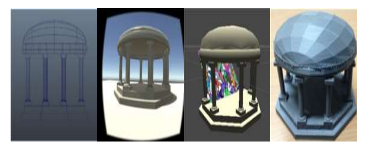
Figure 1: Different ways of representing a dome on columns - 2d traditional view, VR, AR and 3d printed learning artefacts

Tutorials and visualisations to achieve the learning objectives in Table 1 were presented to the learners in the respective groups over twelve weeks. To address problem relevance, representations of each model were created using different mixed reality technology visualisations (i.e. 3d prints, virtual reality models, augmented reality models). An illustrative example of the mixed reality simulation highlighting 3d spatial understanding and communication is provided in Figure 1.