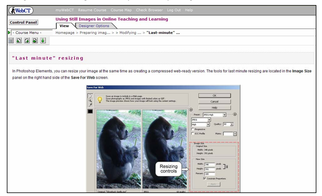
Figure 2. Screen capture from the 'Preparing images for the Web' section of Using still images

Another top-down project was Using still images in online teaching and learning , which has produced a professional development web site and training program for staff in two clusters. It focusses on preparing images for the Web (see Figure 2.) and the use of images for online learning and teaching, as well as issues associated with copyright and image banks. As well as providing an online resource, the team has provided face-to-face workshops for interested academics. The project has been well-received, with positive comments from staff, such as, 'I wish I'd had this years ago!' and 'Brilliant resource to have.'