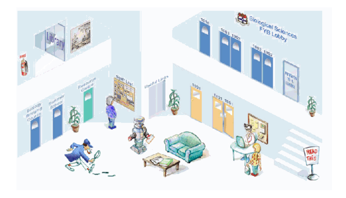
Figure 1. First year biology virtual learning environment (VLE)

dissections microscopy and use of scientific equipment. The disadvantages of using real materials are often managerial and cost-related. The materials themselves may be expensive to buy or collect, the laboratories have to be maintained and teaching staff must be provided. Other disadvantages are associated with the limited flexibility of the modern student. They are often not able to attend oncampus, for a variety of reasons and there may be ethical, ethnic or cultural considerations when working with biological materials.