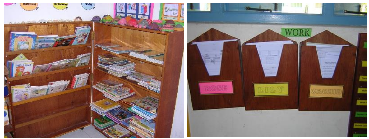
Figure 2: Classroom resources for CFS classrooms

Parents were involved in bringing about changes to the physical appearance of the classrooms by building resources and furniture (Figure 2). These visible changes were signs of a different approach to teaching in the school community (SMT3). Parents could see that established routines were being altered and appeared open to the introduction and application of new methods. The physical changes, it would seem, were necessary at the start of the change process as an indication that the status quo was shifting. One member of the SMT, working with non-CFS teachers noted, "The main thing I found is that the classroom set-up is the main problem" (SMT4). He believed that maintaining the traditional classroom set-up sustains a certain mindset with parents which presents difficulties when promoting pedagogical change.