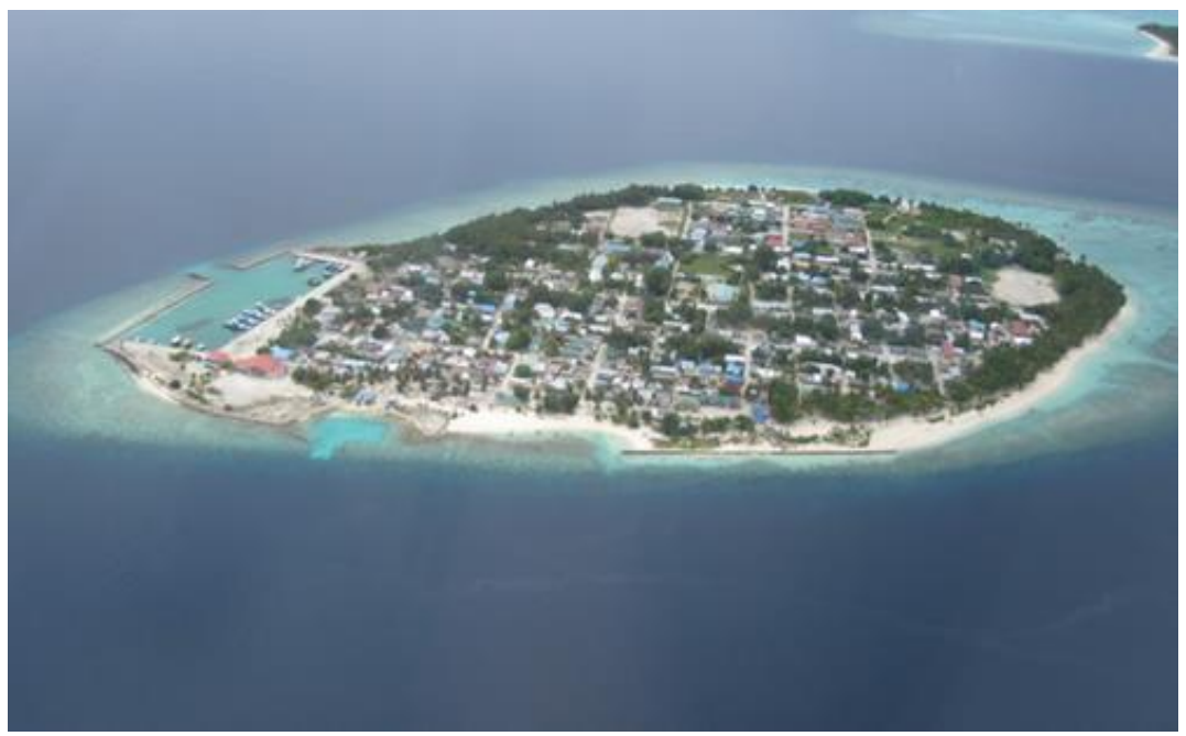
Figure 2: Island shot taken from a seaplane

The study of the surrounding context was designed to provide details of the mesosystem context and elucidate conditions in the school regarding the introduction and use of active learning and the factors supporting its use. The study took place on a local fishing island (Figure 2), referred to as the Research School. It was selected as offering optimum conditions for implementing the intervention because of their proactive approach in implementing CFS. Therefore, the characteristics of this school are of interest in the context of explicating the factors that have influenced reform. It is an Atoll Education Centre, hence the education hub for the atoll. It offers two phases of primary education (Grades 1-4, also referred to as CFS grades) and Grades 5-7 (subject-based teachers) and secondary classes offering O and Alevel education.