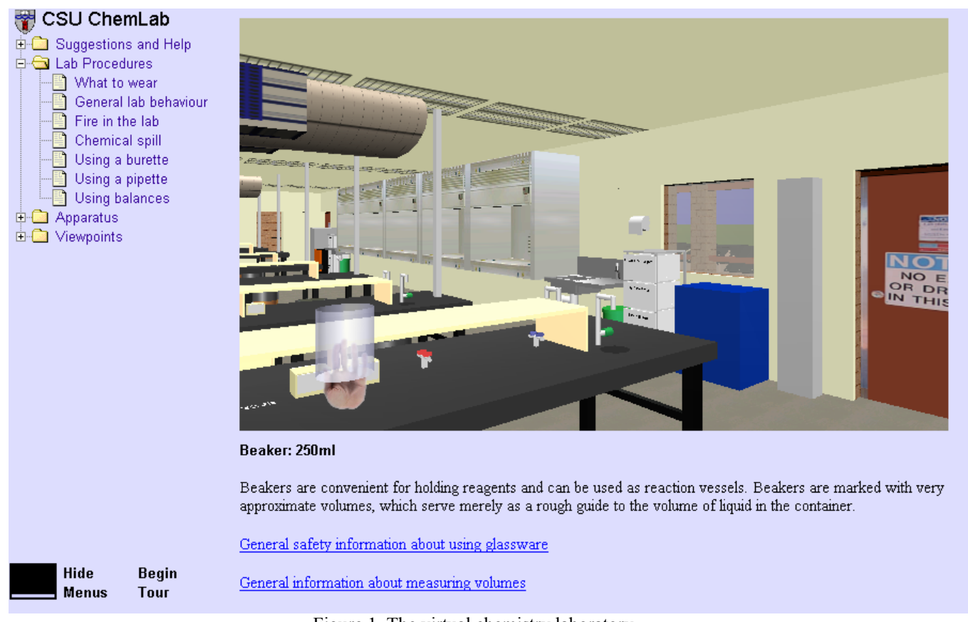
Figure 1. The virtual chemistry laboratory

The use of a virtual laboratory, allowing virtual experiments to be undertaken, could help students to achieve the skills within two of these priority areas. Virtual experiments could potentially allow students to improve their skills in deductive reasoning, hypothesis formation and testing as effectively as through real experiments. Skills in recording, reporting and interpreting data could also be effectively developed through these virtual tasks.