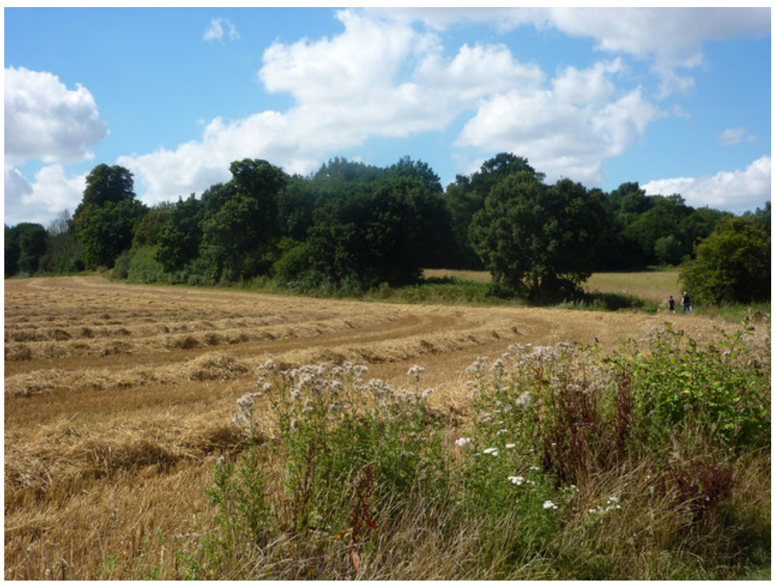
Figure 3. Countryside near Hadleigh

atmosphere of the counties of Suffolk and Esssex, with their flat expanses, sea and skies, among them Henry James, whose The Turn of the Screw is set in a remote country house (Bly) in Essex. Ackroyd, in the aforementioned Albion , goes so far as to describe East Anglia as the predominant force in literature in medieval England (Ackroyd 136); one of the reasons was its particular topographical status, which might be described as 'lowland pastoral': gently rolling, with undulating river valleys, pockets of ancient woodland, fields and small settlements.