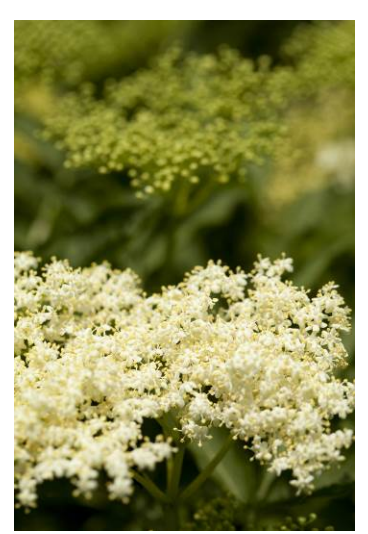
Figure 4. Elderflower

Green is both the English landscape and a wider symbol of Englishness, echoing across the novel, with the green man (4), a 'green god' (68), the 'dank green' marsh (68), 'metallic viridian' (68) and 'softest green as silver' (71). Clare's beloved Alicia has eyes 'green as elderflower' (111). He himself is 'cabbage-like' (23), and the yokel John's hair is 'like frost-bitten grass' (27). The heavy use of metaphor, which, according to David Malouf (44) is a very English feature, illuminates the connections that make this such an evocative work. Ultimately green gives way to white, and by June the symbolic elderflower is 'yellowish white' (141). Alicia makes more English connections with her remark that Constable too loved elderflower (141): he painted them in blossom in 1835, and is known to have written about the tree (see Rhyne, 1990).