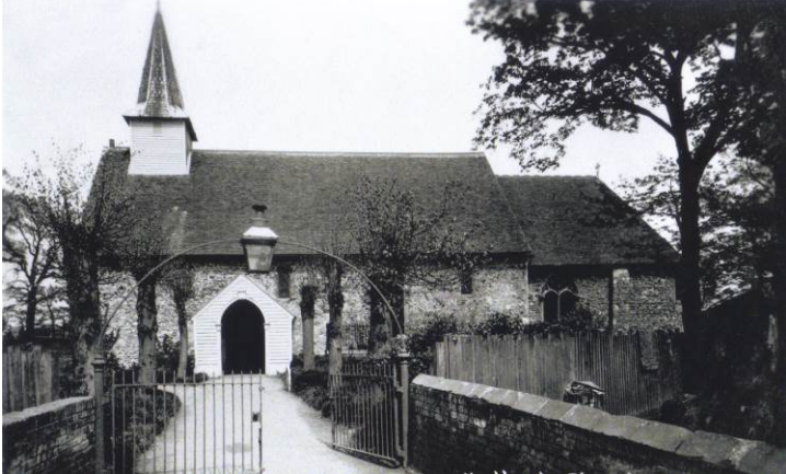
Figure 2. Hadleigh Church

this village and its various historic, pastoral associations thus played a powerful role in the attraction of this area for Stow.