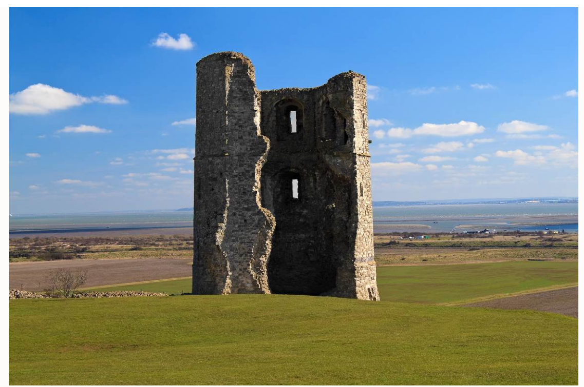
Figure 1. Ruins of Hadleigh Castle

On arriving in England in 1960 Stow made his way to Hadleigh, once one of the wealthiest towns in England, dominated by the cloth trade (see Craig). It still retains a square with a parish church and a fifteenth-century guildhall. Hadleigh's ruined castle, which dates from the 1360s, is situated at a point above the Thames estuary with sweeping views that extend as far as Kent. At one time home to Anne of Cleves, the castle was destroyed in a landslide in the sixteenth century. It features in John Constable's only oil painting, a romanticised landscape of its melancholy crumbling towers completed in 1829. In a number of ways there are parallels between Constable and Stow, with their shared views of Suffolk as a place with open, sweeping skies and 'eerie illumination' (Hawes 456). Constable, like Stow, often looked backwards for inspiration, and for his 1829 painting he used sketches made on a much earlier visit to Hadleigh in 1814. Indeed the 'circling' that can be seen in Stow's work as discussed by Hassall has been commented on more generally as a particularly English trait. Peter Ackroyd in his work Albion describes it thus: 'The English imagination takes the form of a ring or circle. It is endless because it has no beginning and no end; it moves backwards as well as forwards' (Ackroyd xix).