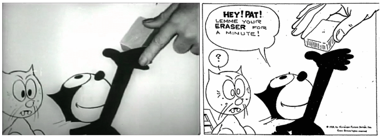
Figure 2: Left, frame from Comicalamities , 1928; right, centre frame from 'Comicalamities' newspaper comic strip, 1928.

animator, rubbing out her facial features and replacing them with more attractive ones. Having transformed her into his ideal mate, Felix showers her with gifts. Now that she is so beautiful, however, she spurns his advances. Felix cures his broken heart by ripping her out of the scene, leaving behind nothing but a blank hole, thus reminding us that this romantic-tale-gone-wrong is nothing more than a two-dimensional drawing on a sheet of paper.