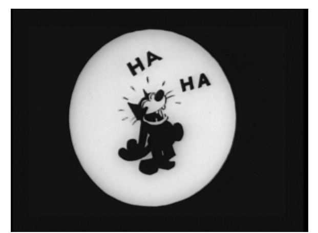
Figure 6: Frame from Felix in Hollywood , 1923.