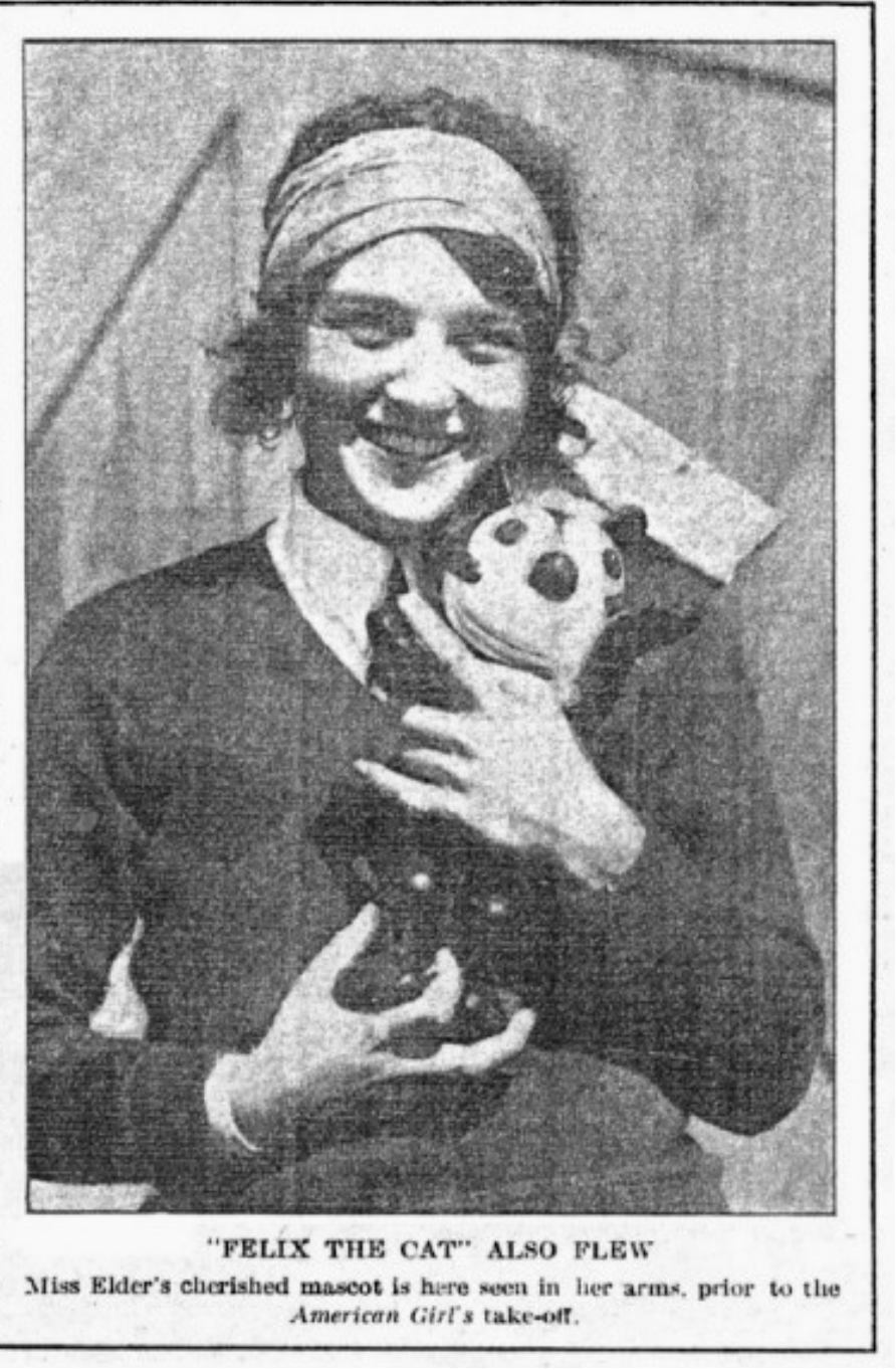
Figure 5: 'Felix the Cat Also Flew.'