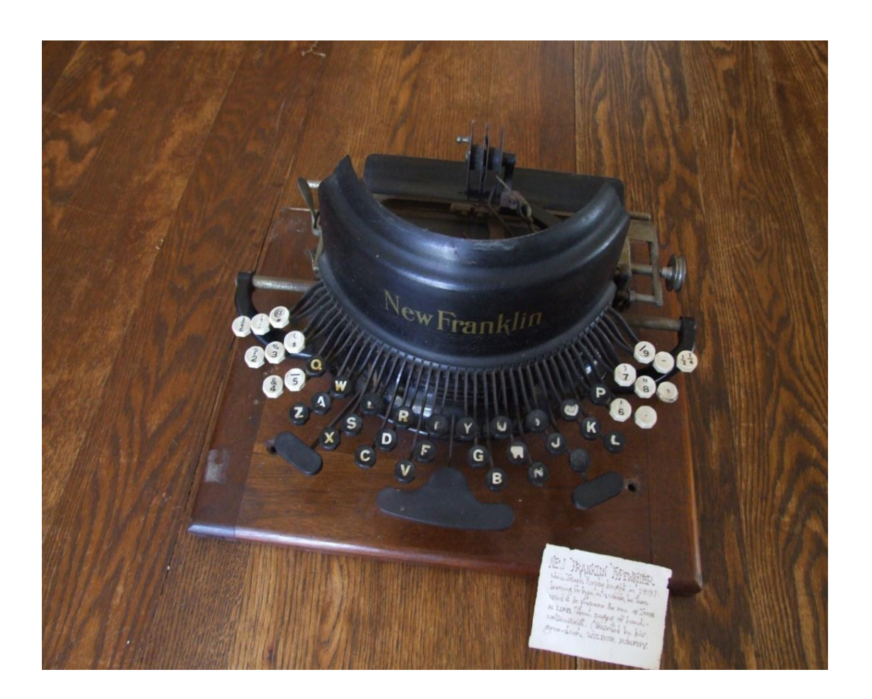
Fig. 1 Joseph Furphy's typewriter at Tom Collins House, Perth.

send his revised manuscript to a Melbourne typist and see his use of dialect corrected: 'In fact, I wouldn't trust any typist to transcribe dialect unless I was standing over sim [him] with a stick' ( Letters 35). But after finding only two typewriters in Shepparton, he decided to purchase a machine for the purpose of producing typed copy, and began the task himself in July 1897. (See fig. 1) It would take him more than twelve months to complete the job.