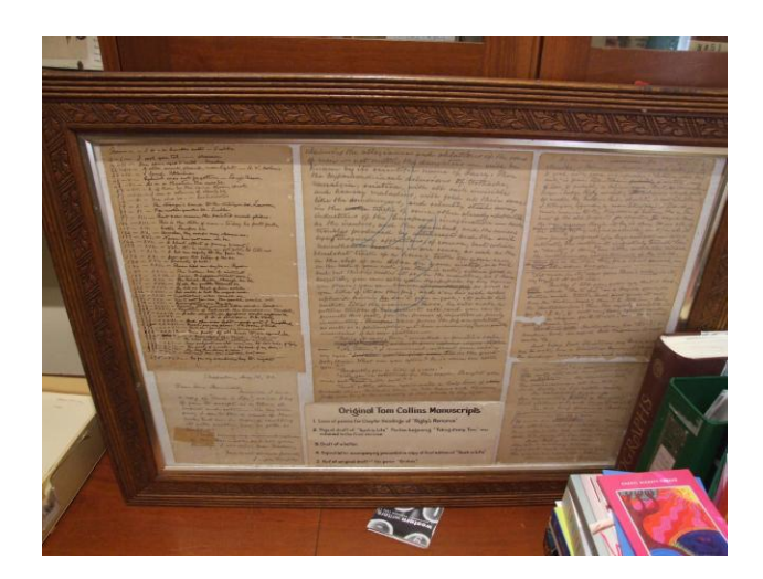
Fig. 3 Joseph Furphy artefacts on display at Tom Collins House, Perth.

several manuscript pages relating to Such is Life and Rigby's Romance are held at Tom Collins House in Perth, pasted to a display board (See Fig. 3). Because of its fragmentation, the scope of the first complete versions of Such is Life can only be guessed at through their relationship to corresponding sections of the extant typescript and to Furphy's descriptions in his correspondence.