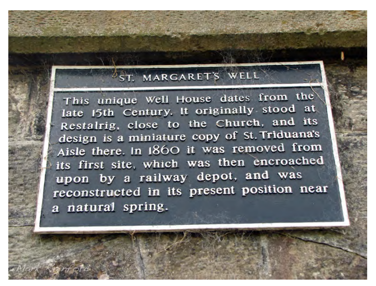
Plaque at St Margaret's Well, describing its original siting at Restalrig.

for its healing virtues to the eyes'. <sup>39</sup> McIvor thinks that St Margaret's wellhead hexagon is a simplified miniature of the James III chapel and thus of later date, and that it is possible, though not likely, that the James III chapel is a wellhouse, albeit a badly designed one. The only comparable example he has found is the fifteenth century shrine to St Winefride in Holywell, North Wales, where the lower storey is a wellhouse and the upper storey a chapel. <sup>40</sup>