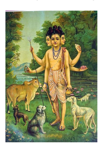
Figure 3 – Raja Ravi Varma, Dattatreva.

Dattatreya (Figure 3).<sup>45</sup> Such ideas were of course in some way derivative from Theosophical ones such as those of Madame Blavatsky and Alice Bailey, but the attempt to portray them in an integral system was new. I mentioned the Amerindian tradition and it was interesting that the Medicine Wheel took the place of the enneagram as the integrative template.<sup>46</sup>