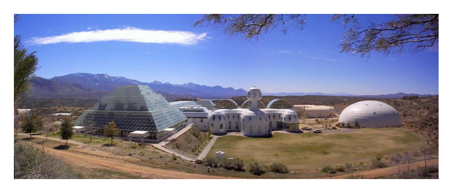
Figure 5 – Biosphere 2.

book about their enterprise, Biosphere 2.<sup>71</sup> It was a three-brained activity involving science, art and engineering. Biosphere 2 was an 'image' of our terrestrial biosphere built in Arizona (see Figure 5). It proved a popular draw and attracted much media attention, until the tide turned and it became subject to attacks in the media that led to a gun-point take over by their main financier. For me the project was a totally extraordinary and much to be welcomed example of creative experimentation in the real world. This was 'the Work' in new guise perhaps. But it had been an esoteric experiment perhaps doomed to failure. It challenged too much of mainstream culture and science to be allowed to survive. Its fate paralleled the suppression of heresies in medieval times.