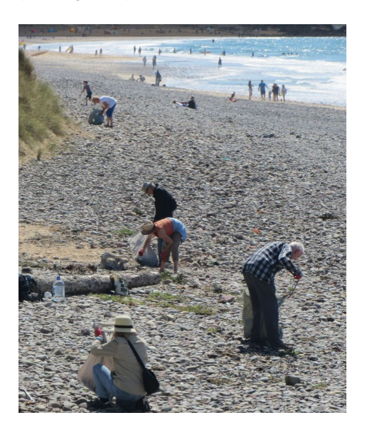
Figure 9 – Author, foreground right, with group picking up litter from a beach.

in. What the particular activities were scarcely mattered. We spent most of the day clearing litter from a beach and it was the same as meditating or doing movements (see Figure 9).