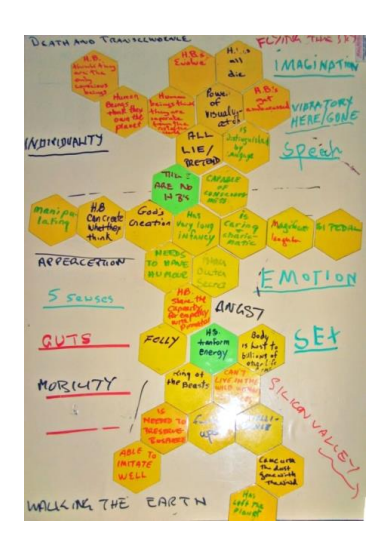
Figure 8 – LogoVisual exercise on idea of Higher Bodies (author's own image).

Putting things together I concluded that the action of integration required conscious energy and this was not generally available. I found more evidence of this in my work on what became LogoVisual technology (see Figure 8) and began as structural communication. In the early days of structural communication I was amazed to see that intelligent people employed by such organisations as IBM and Westinghouse could not actually create study material we - the young group around Bennett - could do quite easily.