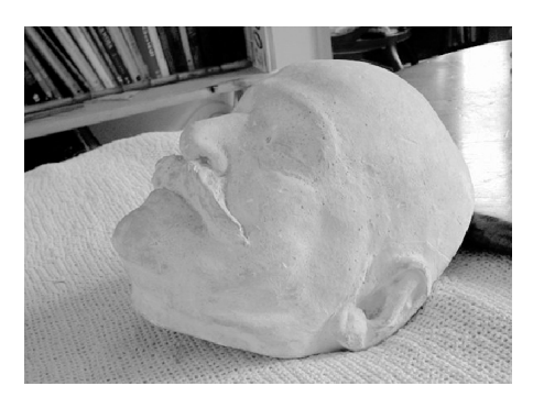
Figure 2 – Copy of head of Gurdjieff.

Gurdjieff has spoken of the need to spiritualise the three centres in us in coming to fuse them into a harmony that he called 'having a real I'. The devotional side was allied to heart awakening, certainly related to Gurdjieff's higher emotional centre. A paramount demand was to speak the truth from the heart . This was no invitation to indulge in emotional expression. The real thing was unmistakable. I myself was deeply affected by this spontaneous practice. It deepened my sense of the conscious power of speech as revelation.