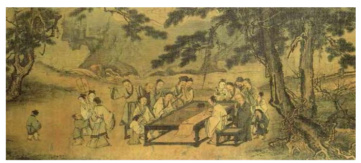
Chinese Art Collection, Kansas City: The Nelson-Atkins Museum of Art, USA

The following painting of winter bamboo and rock is a work of collaboration of five artists: Gu An, Zhang Shen and Yang Weizhen composed the painting together; and later Ni Zan added the rock, as well as the inscription in the upper right-hand corner.