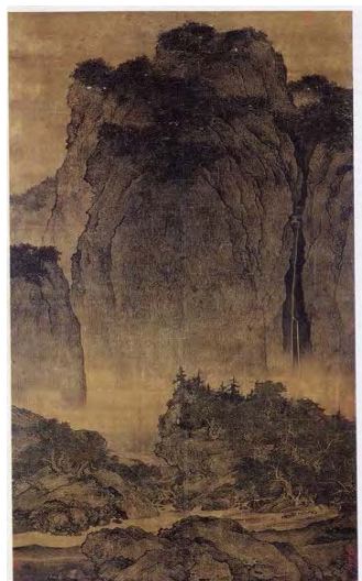
Left: Guo Xi, Early Spring (Hanging scroll, ink and light colours on silk. National Palace Museum, Taipei).

Right: Fan Kuan, Travellers Among Streams and Mountains (Hanging scroll, ink and colour on silk. 81 1/4 x 40 3/4 in. National Palace Museum, Taipei).