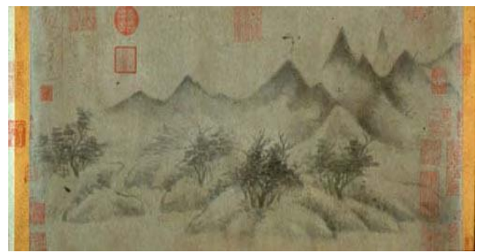
In Heilbrunn Timeline of Art History (New York: The Metropolitan Museum of Art, 2000).<sup>34</sup>

Take Mi Youren's painting 'Cloudy Mountains,' for example. It is very different from the Northern Song realistic landscape painting: there is not much formal likeness, but a personal voice – the cloudy peaks could be seen as signs of the interior peaks and valleys hidden in the painter's heart and soul.