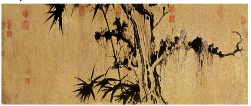
Wang Tingjun, Youzhu kucha tu (Secluded Bamboo Withered Stubbles), Liang Song huihua vol. 1 Zhoungguo meishu quanji huihua bian (Beijing: Wenwu chubanshe, 1988), p. 158.

and odd rock, the simple strokes and sparse lines that leave large space for the qi to circulate, as well as the vivid and bold outlines that reveal a spontaneous and free spirit.