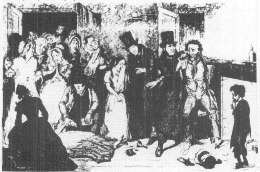
PLATE VII. The husband, in a state of drunkenness, kills his wife with the instrument of all their misery.