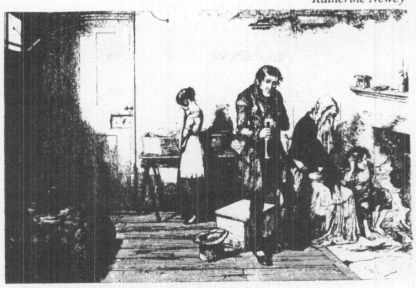
PLATE V. Cold, misery and want, destroy their youngest child: they console themselves with the Bottle.