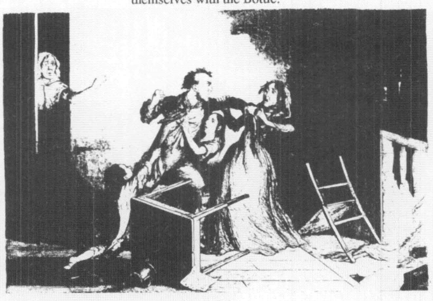
PLATE VI. Fearful quarrels, and brutal violence, are the natural consequences of the frequent use of the Bottle.