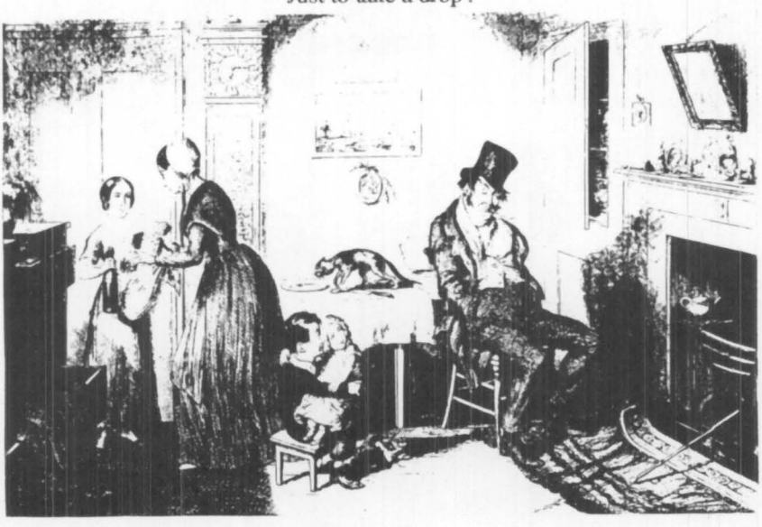
PLATE II. He is discharged from his employment for drunkenness: they pawn their clothes to supply the Bottle.