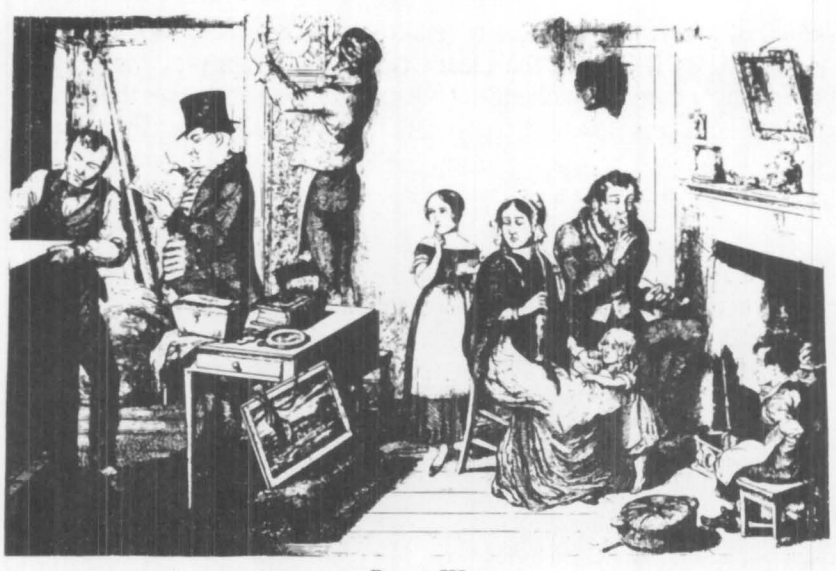
PLATE III. An execution sweeps off the greater part of their furniture: they comfort themselves with the Bottle.