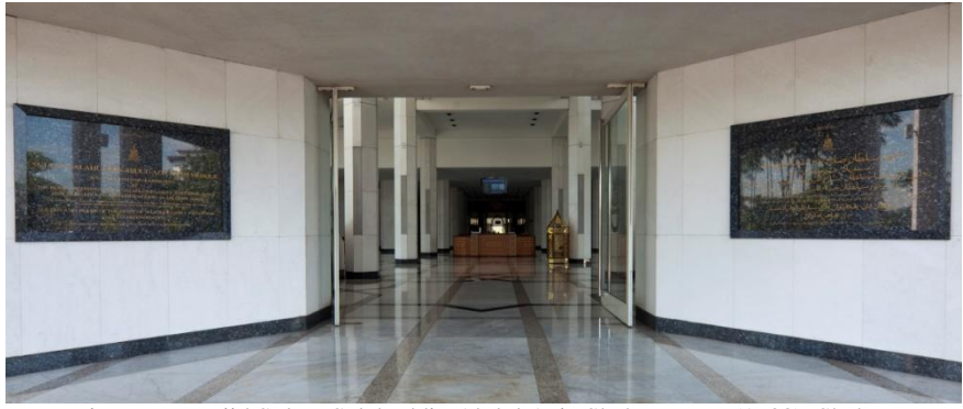
Figure 6: Masjid Sultan Salahuddin Abdul Aziz Shah mosque (1988), Shah Alam, Malaysia, twin foundation panels