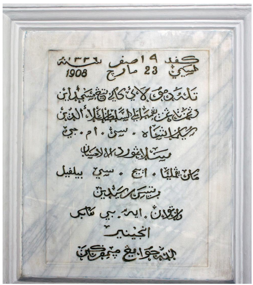
Figure 4: Masjid Jamek (1908), Kuala Lumpur, Malaysia foundation panel