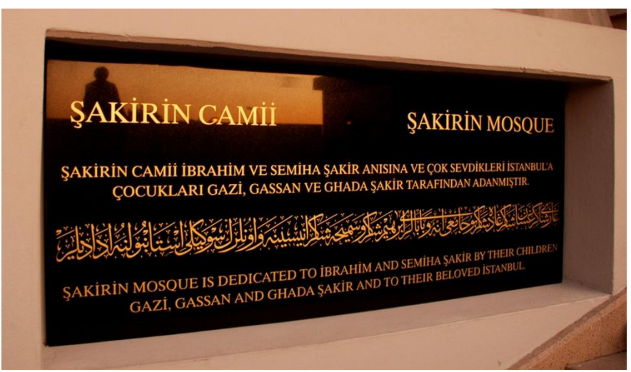
Figure 3: Şakirin Mosque (2009), Istanbul, Turkey, foundation panel