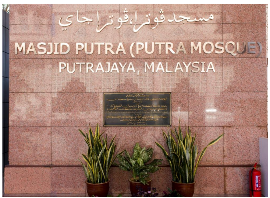
Figure 5: Masjid Putra (1999), Putrajaya, Malaysia, foundation panel