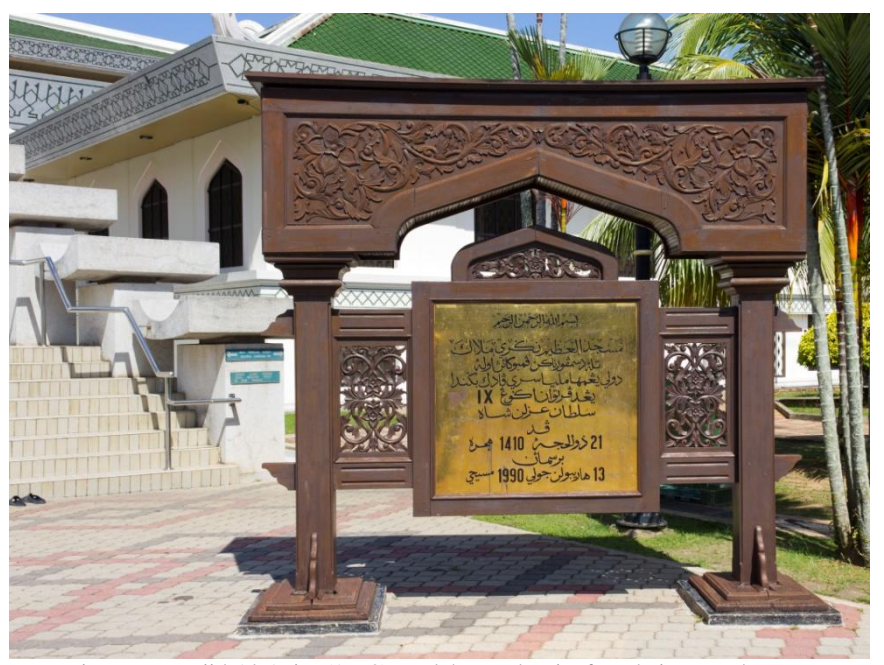
Figure 7: Masjid Al-Azim (1990), Melaka, Malaysia, foundation panel