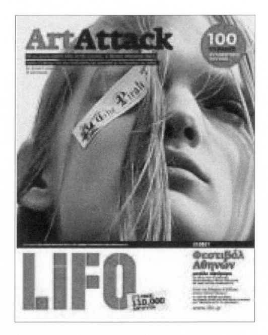
Figure 4: Lifo (2007) – coversheet of issue 69.

of adaptations of foreign and local literature, a revival of the modern Greek play, and free experimentation with unfamiliar staging spaces and low budget shows due to the global financial crisis (Kaltaki 2008). Even the violent street riots that broke out due to the death of a teenager shot by the police at the end of 2008 became a source for inspiration for investigative journalism and creative expression in the city's guide.