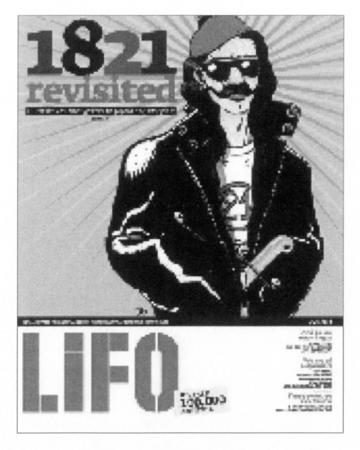
Figure 1: Lifo coversheet of issue 59. Photo by Taxis. Source <a href="http://www.lifo.gr/issues/view/59">http://www.lifo.gr/issues/view/59</a>.

high tech developments, interest in European city policies and English headlines. Digitized portraits of Andy Warhol and 'popera' singer Maria Callas for instance appeared side by side with English head titles such as 'Free equals Freedom' and 'The Future is Wow' (Lifo 2007 \alpha ).