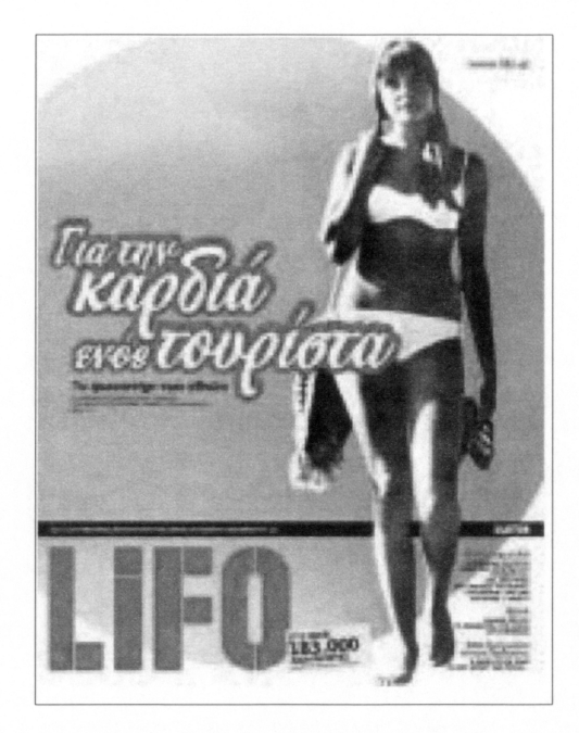
Figure 3: Lifo (2008) 'For the heart of the tourist' – coversheet of issue 122. Source <a href="http://www.lifo.gr/issues/view/122">http://www.lifo.gr/issues/view/122</a>.

Many issues promoted innovative aspects of large cultural events such as the Festival of Athens and Epidaurus, stressing their newly won power to attract large scale international productions; they also gave extensive coverage to local or foreign live musical shows hosted in city clubs and youth parties. Lifo itself organized a series of musical events called Lifo Nights which initially attracted 13,000 fans, invited distinguished foreign DJs and musicians, encouraged\s party spirit in the streets and squares of Athens, and in 2009 sponsored the initiative Lifo Illustrations . Apparently, far more than simply (re)presenting the city, the magazine deployed visual communication as a powerful editing tool, and most importantly, participated actively in the city culture in constant interaction with people from the creative industries and young artists.