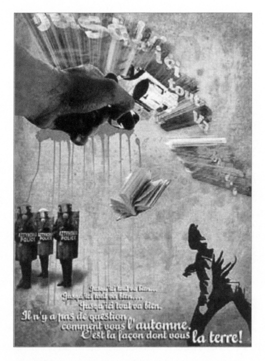
Figure 5: Lifo (2008)'Riots in Greece: Designer Reaction'. Poster by Nassos K.

already second generation migrants in Athens (Hulot 2007). Another article noted that the majority of those arrested by the police during the riots were not Greeks, but migrants. The echo of increasing intolerance reached the magazine offices when the editor became the target of outraged extreme right wing blogs after his intervention in the sale of Nazi books in an open book market in the centre of Athens.