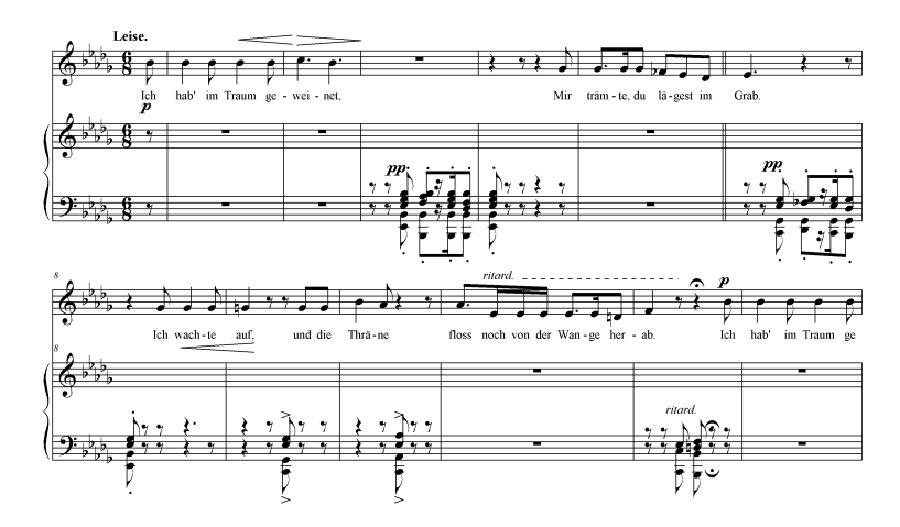
Figure 7 Robert Schumann, "Ich hab' im Traum geweinet," bb. 1–12