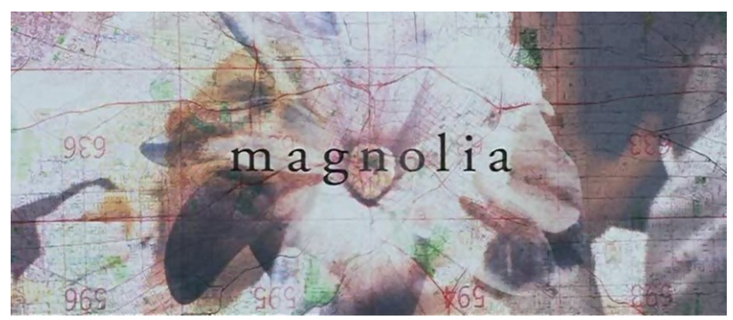
The title sequence of Magnolia