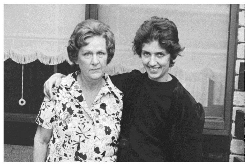
Fig 1. The Silences Ethel and Margot (detail) from Our mums and us series. 1976.

family photographs that I had taken and a few taken by professional photographers.