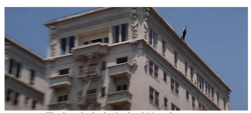
The three deaths that bookend Magnolia

Gesturing to its literary antecedents and again reasserting the fictive nature of the film, Magnolia signals its denouement with an intertitle. This intertitle reads: 'So Now Then'. The shot cuts back to the three separate events that commenced the film. We are again presented with impossible