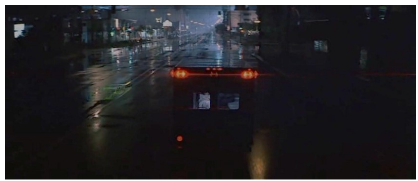
A San Fernando Valley street