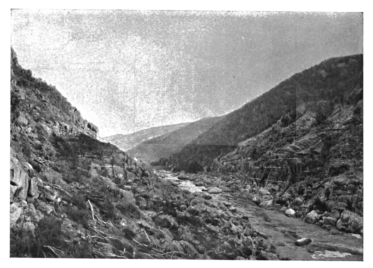
SITE OF BARREN JACK DAM WALL.