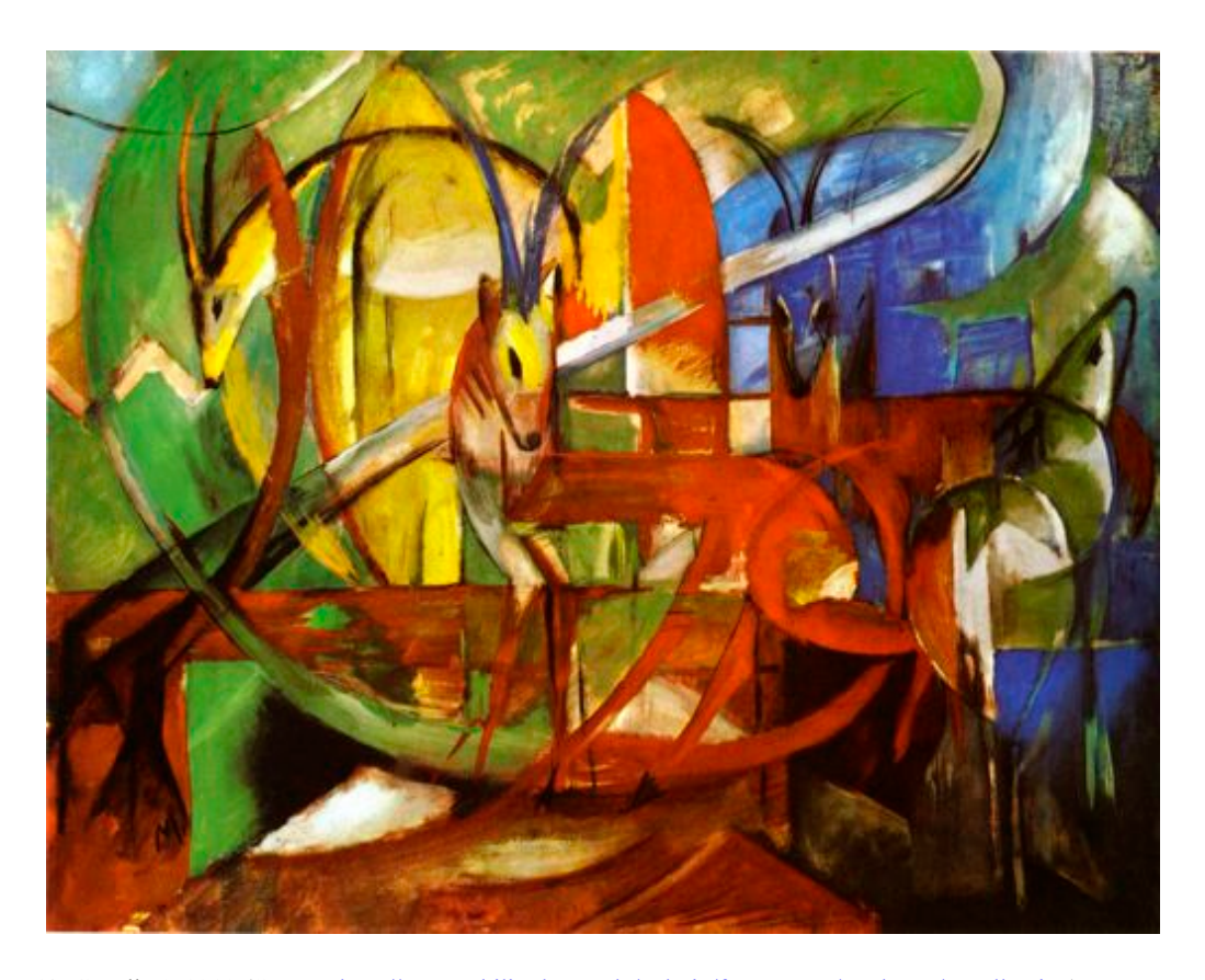
f4 'Gazelles', 1913

It is clear from his pictures that Marc was not seeking simply to evoke the world as perceived by the animal, but concerned with a greater metaphysical unity of nature which reveals a clear Romantic heritage. Marc's pursuit of the animal motif was a way of reconnecting the human with the universe. In a letter from 1910, he writes: