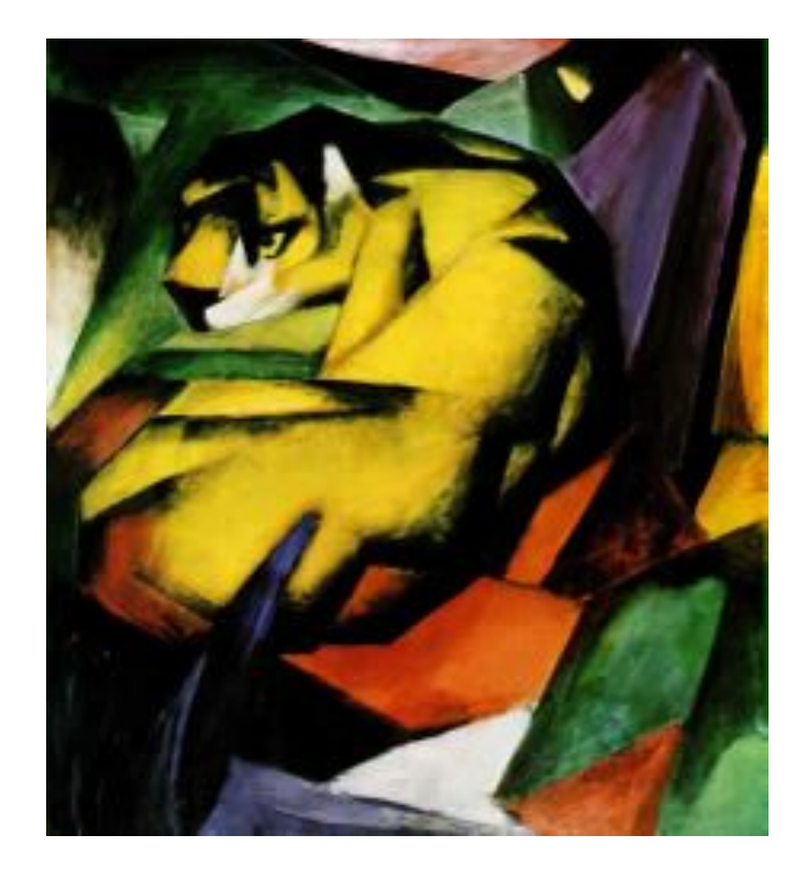
Fig. 1 'The Tiger', 1912

Consider now how this ideal is realised in his painting, 'The Tiger' ('Der Tiger') from 1912 (fig. 1).