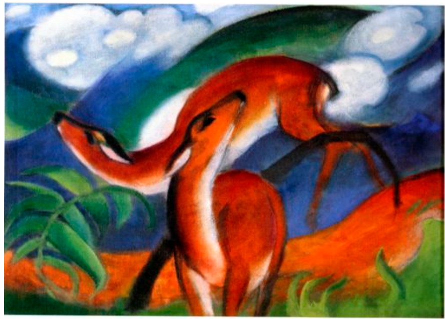
Fig. 3 'Red Deer II', 1912

In the painting 'Red Deer II' ('Rote Rehe II', fig. 3) the arcing bodies and postures of the deer complement one another and are echoed in the undulating landscape, curved clouds and vegetation. The white underside of their bodies matches the surrounding cloudlike shapes and their red fur matches a trail where they walk and complements the green in the landscape. In contrast to 'The Tiger,' this painting conveys a gentle and ethereal quality that is in keeping with the character of deer.