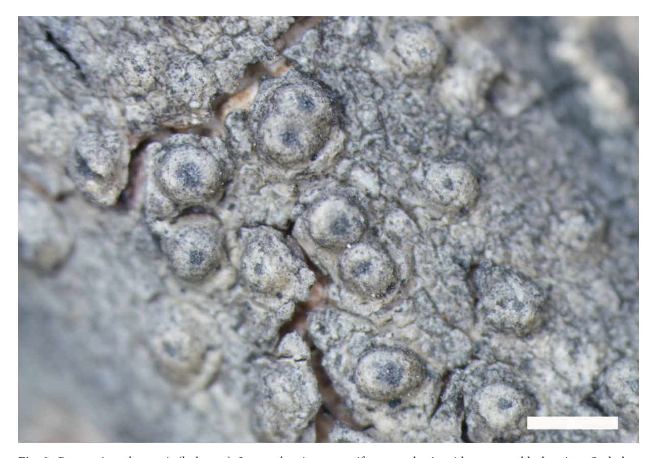
Fig. 3. Pertusaria yulongensis (holotype). Image showing verruciform apothecia with concave, black apices. Scale bar = 1 mm.

Additional specimen examined : CHINA: Yunnan: Yulong County, Lidiping, alt. 3250 m, on branch, J. X. Xi 0159(h), 16 Jun 1984 (KUN 11537).