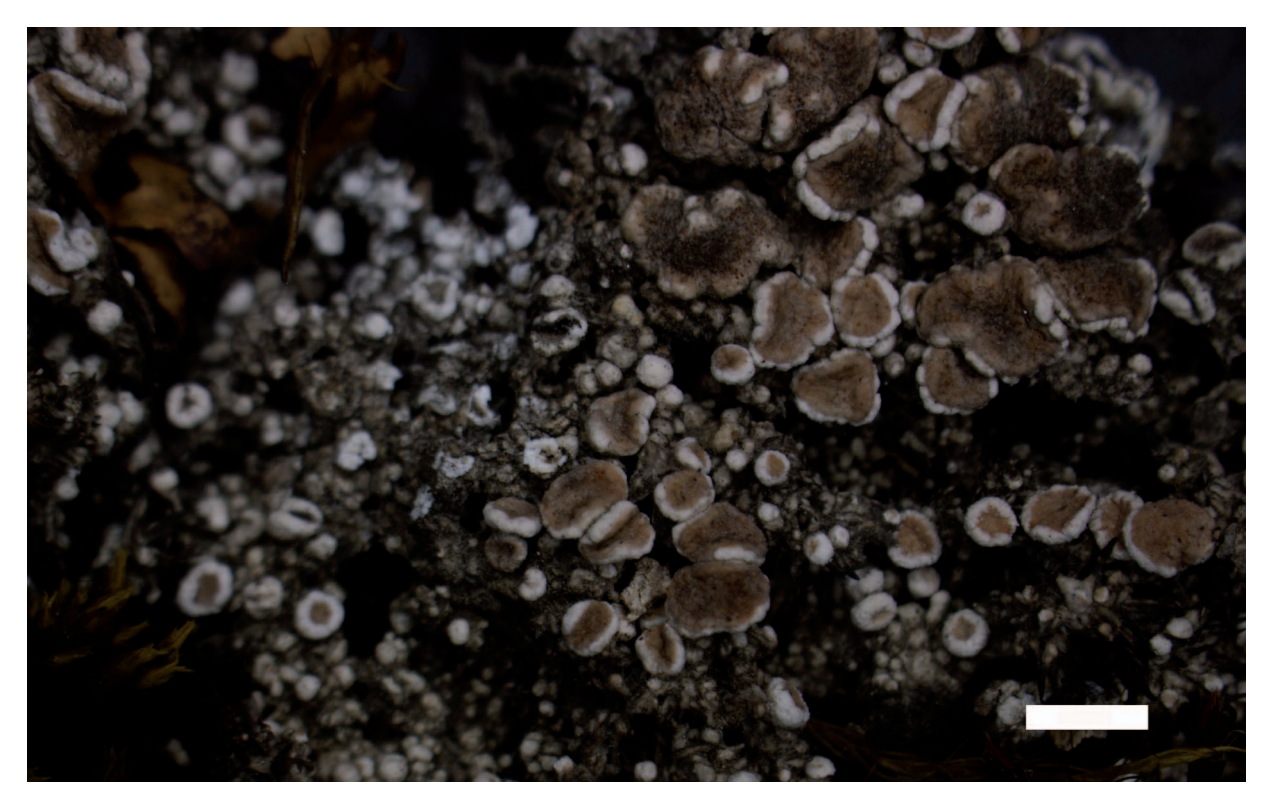
Fig. 2. Pertusaria montana (holotype). Image showing a muscicolous thallus and disciform apothecia with epruinose or slightly pruinose, pink disc. Scale bar = 2 mm.

Comments : Pertusaria montana resembles P. bryontha both in general appearance and habitat. Both are arcticalpine species growing on mosses and plant debris and contain one ascospore per ascus. Pertusaria bryontha has a dark brown disc, contains stictic acid and its epihymenium is K+ purple (Chambers et al. 2009) whereas the new species has a pink disc, lacks stictic acid and has a K- epihymenium.