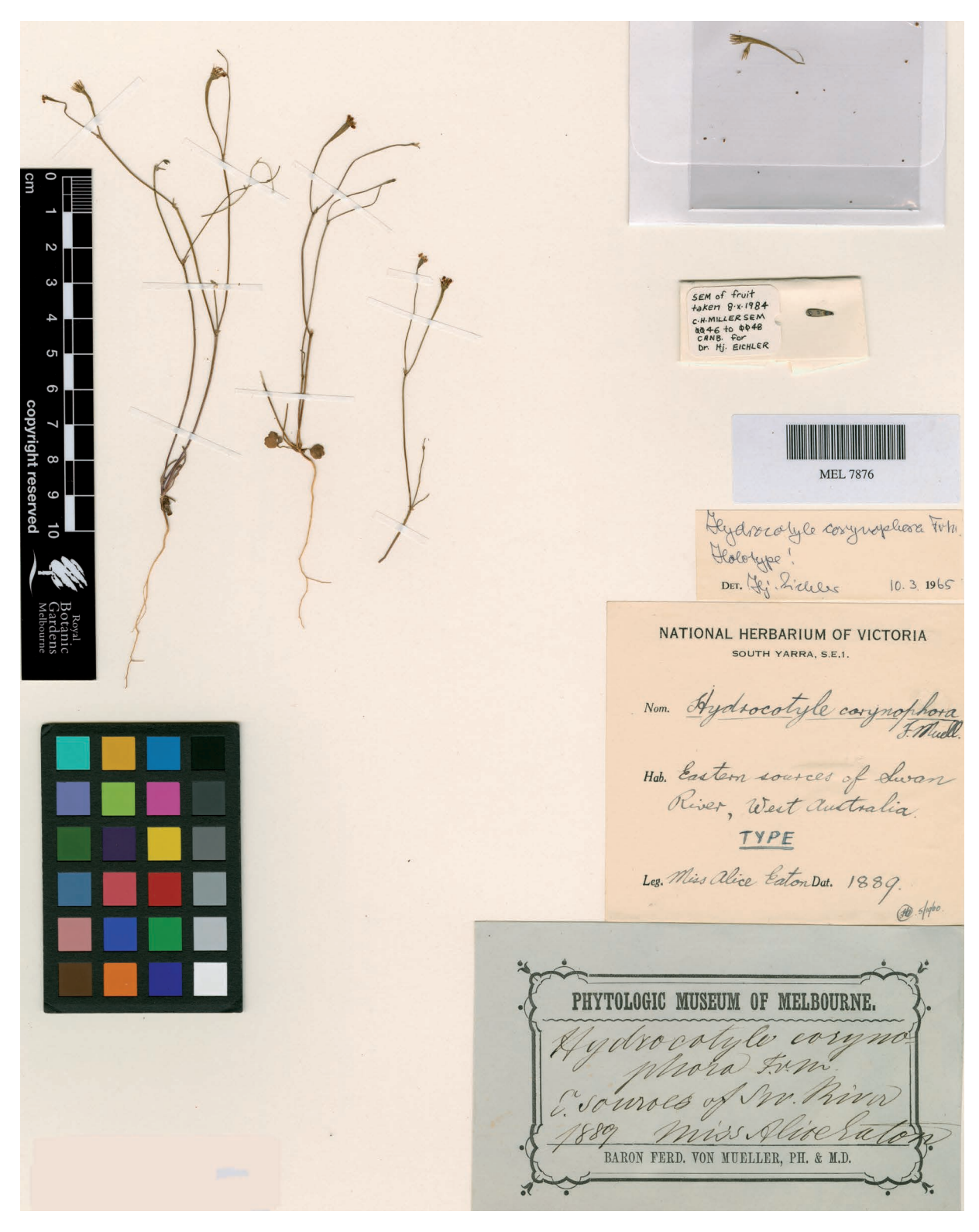
Fig. 1. Holotype of Hydrocotyle corynophora F.Muell. (MEL7876)