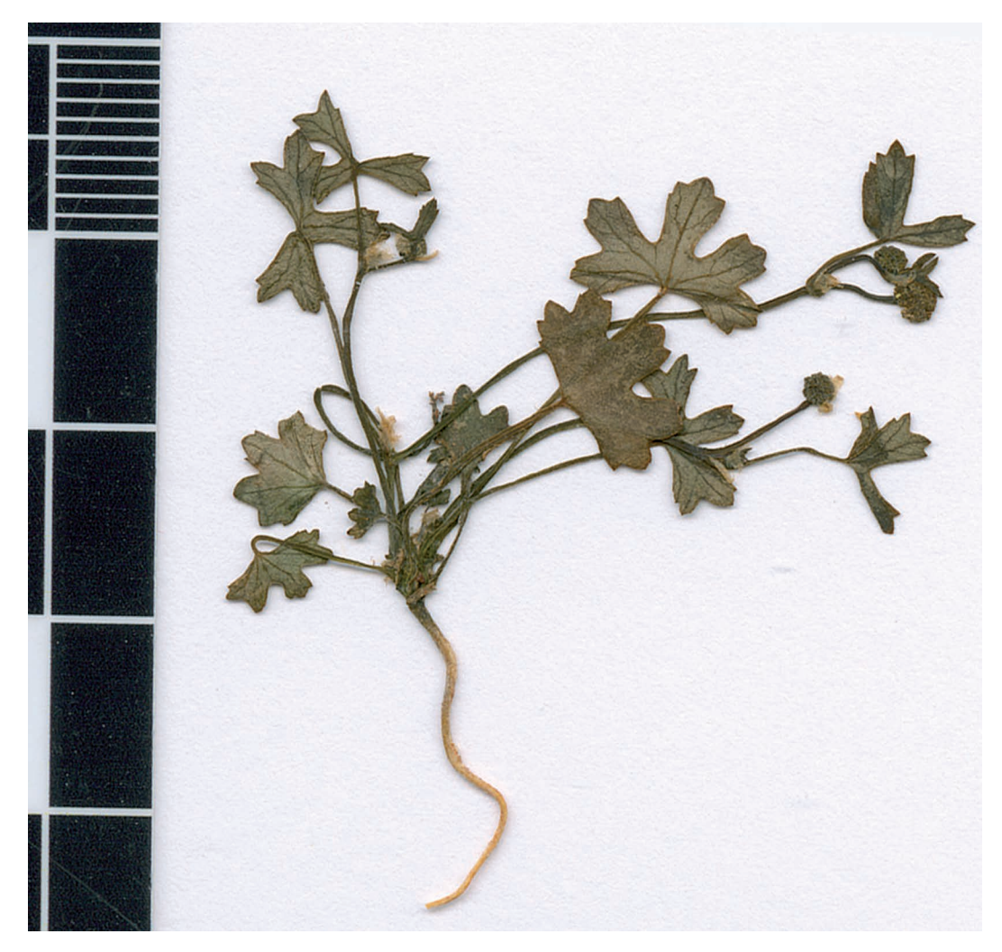
Fig. 3. Hydrocotyle corynophora ( K.R. Newbey 6035 , PERTH 03401502). A single plant from the voucher exhibiting a good representation of leaf morphology for the species. Scale on the left indicating both centimetre and millimetre increments.

Additional specimens examined: WESTERN AUSTRALIA: COOLGARDIE: Southern Cross: All nine voucher specimens collected south-east of Southern Cross, within the vicinity of Marvel Loch, [precise localities withheld for conservation reasons], K.R. Newbey 6035, 21 Sep 1979 (PERTH 03401502); J. Warden & D. Leach 37945, 29 Sep 2015 (PERTH 08684529); J. Warden & D. Leach 37954, 21 Oct 2015 (PERTH 08684527); J. Warden & D. Leach 37955, 21 Oct 2015 (PERTH 08684545); J. Warden & D. Leach 37951, 22 Oct 2015 (PERTH 08684502); J. Warden & D. Leach 37952, 22 Oct 2015 (PERTH 08684553); J. Warden & D. Leach 37953, 22 Oct 2015 (PERTH 08684561); J. Warden & D. Leach 37949, 23 Oct 2015 (PERTH 08684499); J. Warden & D. Leach 37950, 23 Oct 2015 (PERTH 08684510).