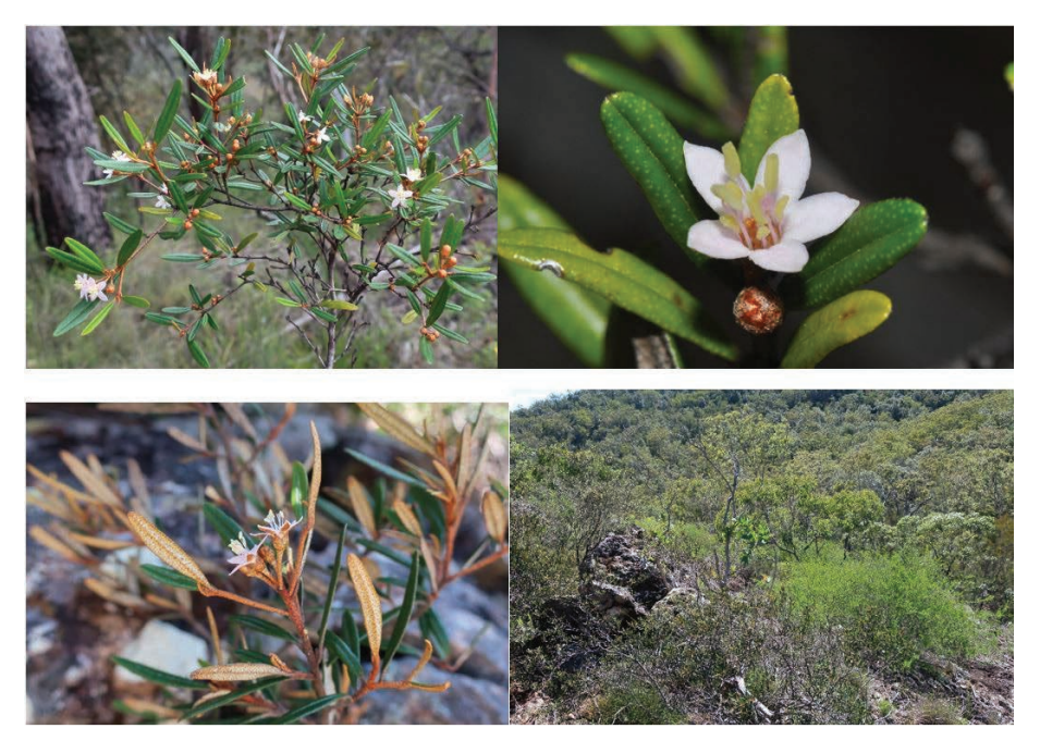
Fig. 1. Phebalium cicatricatum. a (top left), habit of flowering branch ( Ford 6778 ). b (top right), close-up of flower. c (bottom left), close-up of flowering branchlet showing inflorescence structure (leaf removed from flower at front on right hand side). d (bottom right), habitat showing rhyolite substrate.