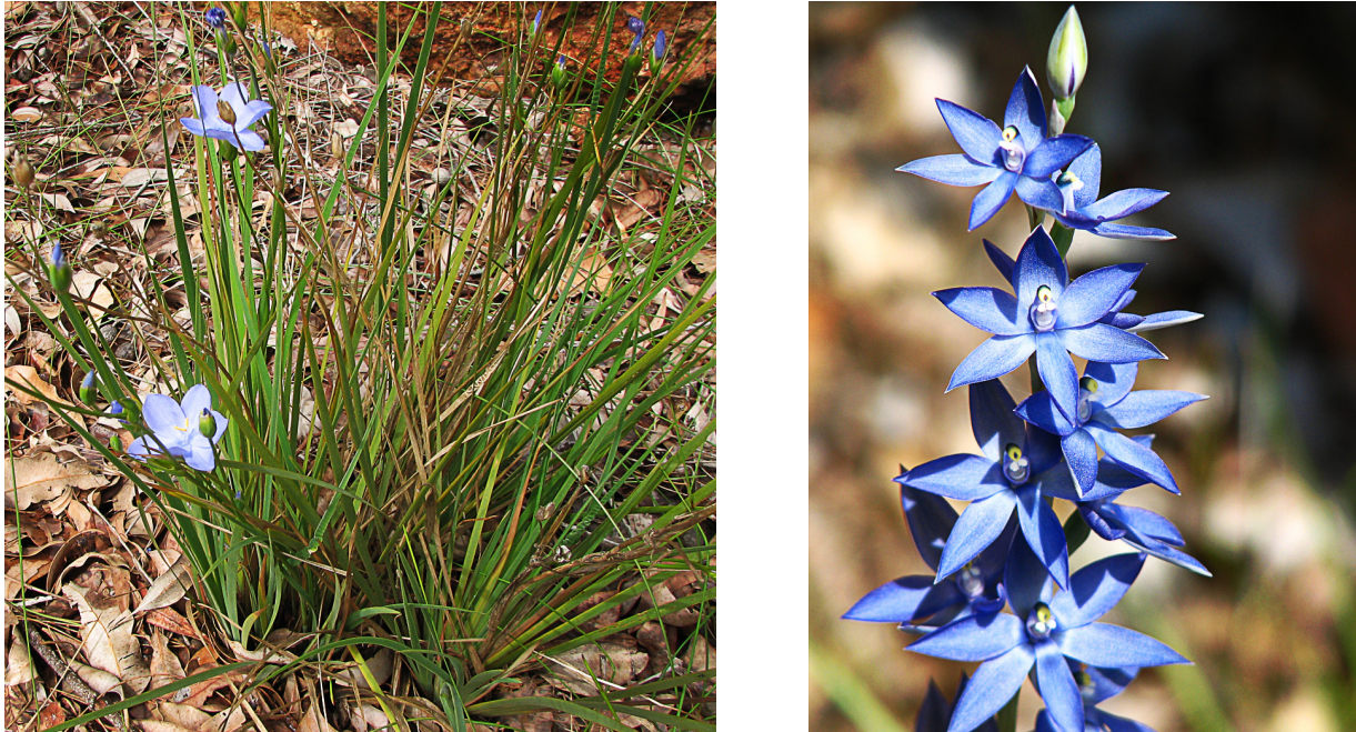
Fig. 1. Putative model (left; O. laxus ) and mimic (right; T. macrophylla )