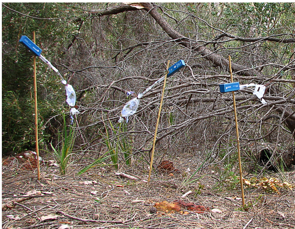
Fig. 3. Fragrance collection of O. laxus at the Lesmurdie site in October, 2009. Note that the floral fragrance collection equipment is supported by bamboo stakes.

During its flowering season, a raceme of T. crinita consisted of less than four open flowers (mean = 3.18; sd = 2.75; range = 0–13) on warm, sunny days while O. laxus was in flower. A raceme of T. macrophylla produced less than nine flowers (mean = 8.43; sd = 5.58; range = 0–19) under the same weather conditions while O. laxus was in bloom.