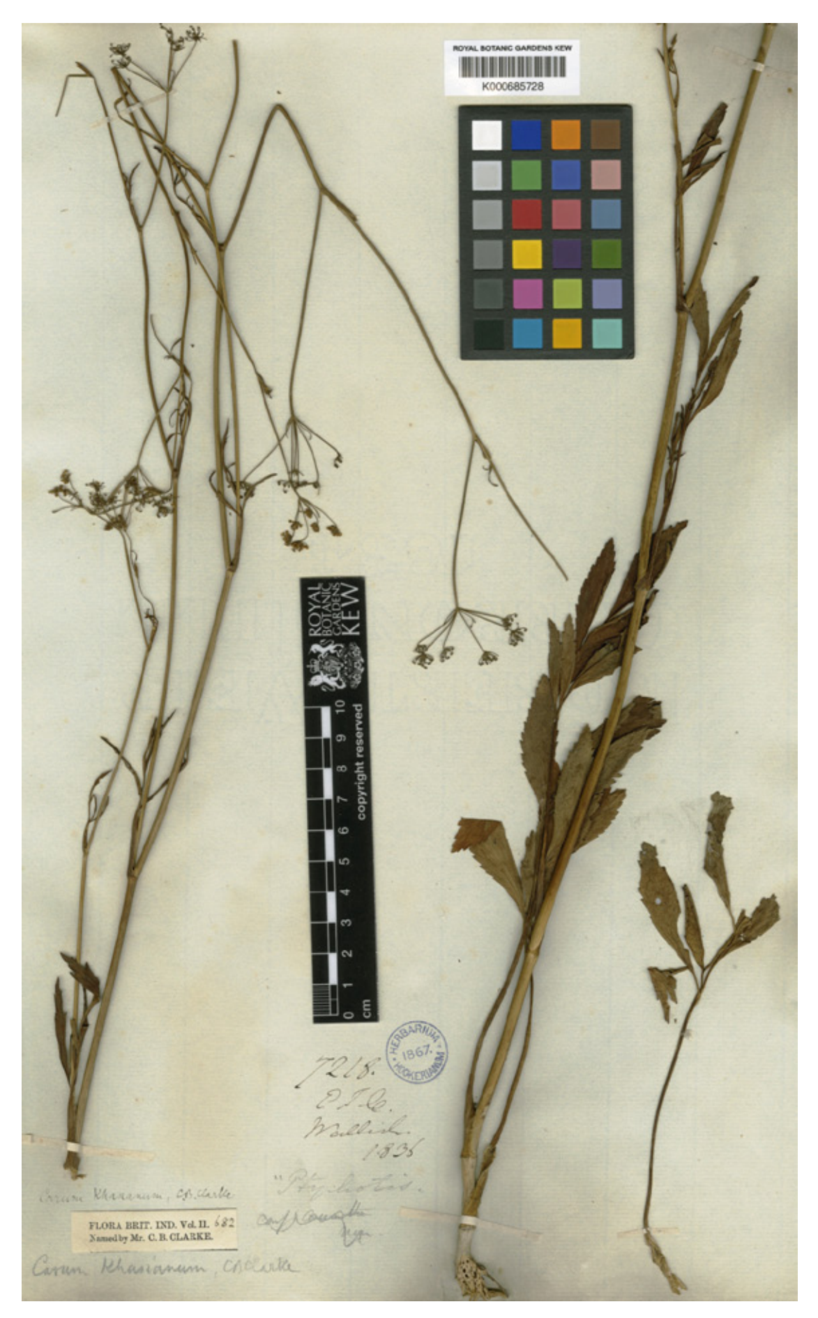
\textbf{Fig. 2.} \ Lectotype \ of \ \textit{Trachyspermum khasianum} \ (K685728, @ \ the \ Board \ of \ Trustees \ of \ the \ Royal \ Botanic \ Gardens, \ Kew).