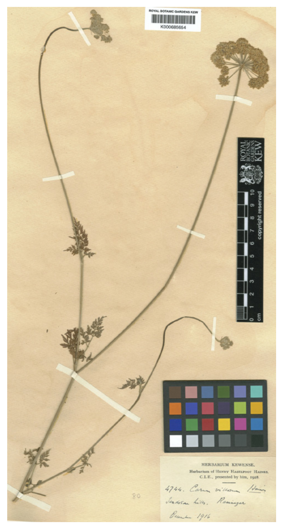
Fig. 4. Lectotype of Trachyspermum villosum (K685654, © the Board of Trustees of the Royal Botanic Gardens, Kew).