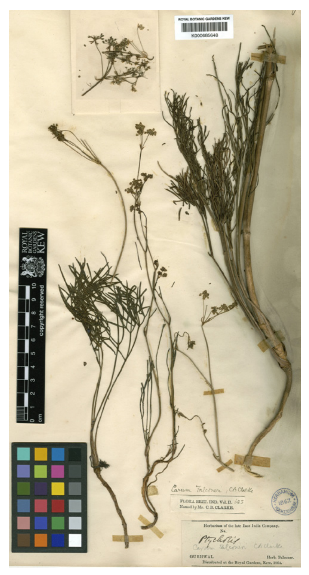
\textbf{Fig. 1.} \ Lectotype \ of \ \textit{Trachyspermum falconeri} \ (K685648, @ \ the \ Board \ of \ Trustees \ of \ the \ Royal \ Botanic \ Gardens, \ Kew).