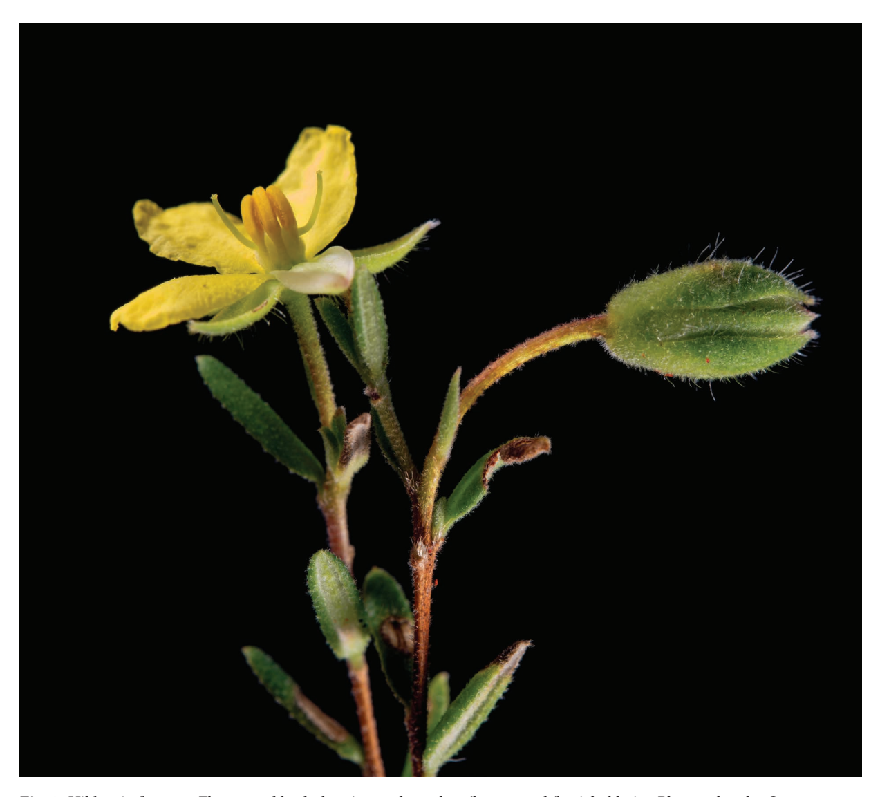
Fig. 2. Hibbertia fumana. Flower and bud, showing pedunculate flowers and fascicled hairs.