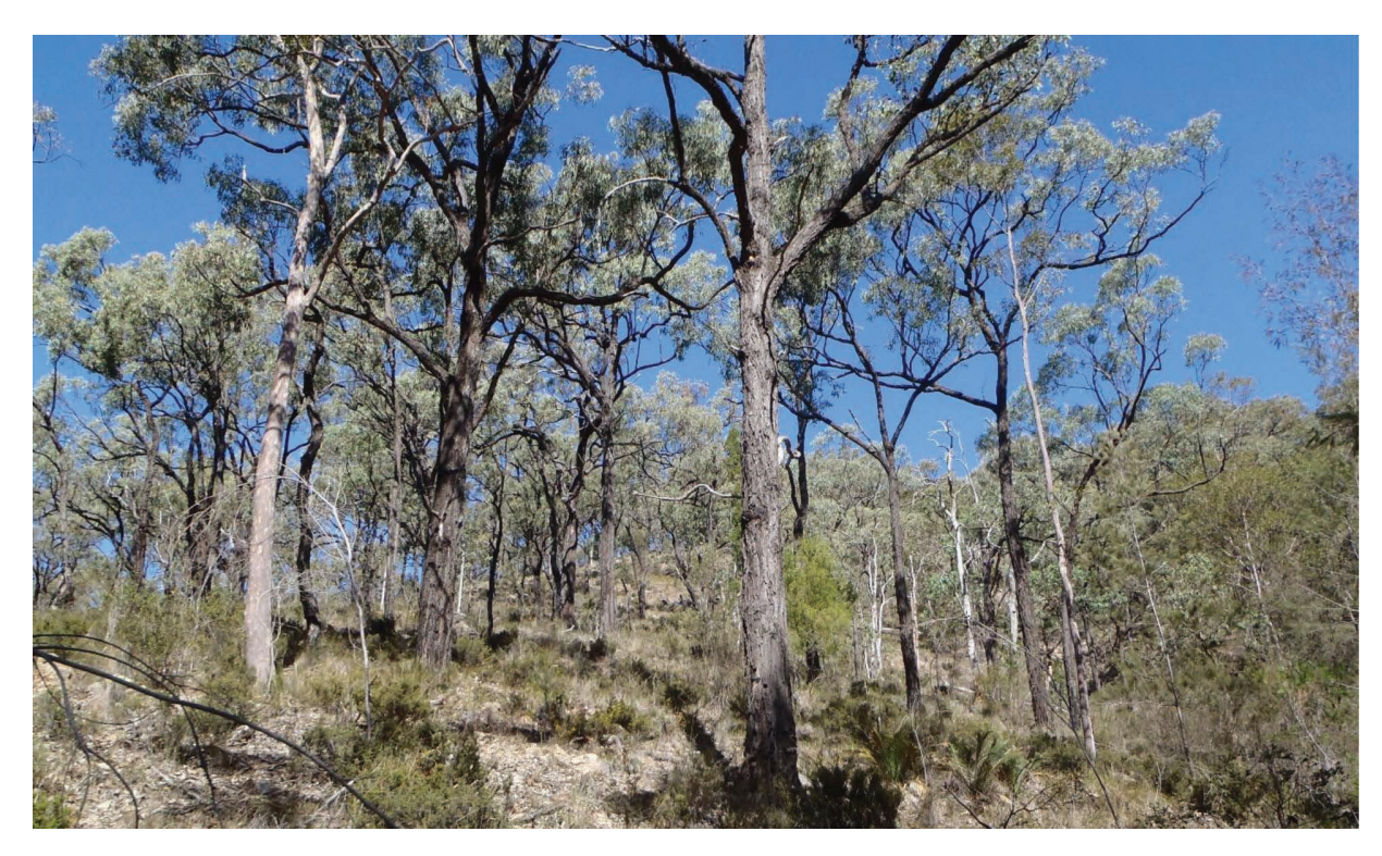
Fig. 3. Eucalyptus calidissima habitat, the new taxon dominating exposed upper slopes, Broken Back Range.

Distribution : Known only from the lower North Coast of New South Wales, near Pokolbin in the Hunter Valley (Fig. 4), where it occurs on the northern foot slopes of the Broken Back Range. Considerable survey effort has been expended in this part of the Hunter Valley since the mid-1990s, but no other stands of similar ironbarks have been reported. Surveys of Pokolbin State Forest (Binns 1996), Yengo National Park (Bell et al. 1993; NSW DECC 2008) and Wollemi National Park (Bell 1998; NSW OEH 2012) have failed to reveal additional populations. Further afield, no collections or observations have been reported for Goulburn River National Park (Hill 1999), Munghorn Gap Nature Reserve (Hill 1999; NSW DEC 2004), Manobalai Nature Reserve and adjacent crown lands (Bell 1997; Peake 1999), or the Myambat army base near Denman (Fallding et al. 1997; Jacobs 2014).