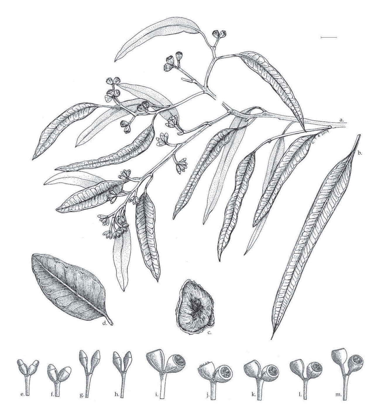
Fig. 1. Eucalyptus calidissima ; a, flowering and fruiting branch; b, adult leaf, adaxial (upper) surface; c, seed; d, juvenile leaf, adaxial (upper) surface; e-h, bud variation; i-m, fruit variation. Scale bar: a = 20 mm; b = 15 mm; c = 0.5 mm; d = 15 mm; e-m = 8 mm. Artwork: Chris Rockley (a-d, from isotype) and Van Klaphake (e-m, unvouchered specimens from within population at type locality).

Type: Australia: New South Wales: North Coast: Pokolbin State Forest, off De Beyers Road, c. 4.2 km SW of Pokolbin, Hunter Valley (32°47'10"S 151°15'37"E), S.A.J. Bell 5597 , 20 Oct 2018 (holo: NSW 1061184; iso: BRI, CANB, DMHN, K, MEL, NE, SYD).