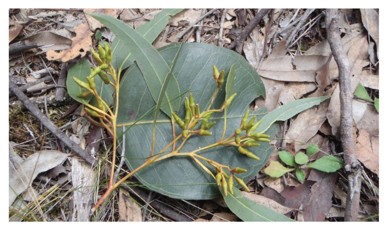
Fig. 6. Eucalyptus fibrosa buds (fresh), adult leaves and single juvenile leaf (Columbey National Park, Clarencetown).

The ribbed or winged hypanthia and fruits of E. fergusonii subsp. dorsiventralis may be confused with the buds and fruits of E. calidissima , particularly as this taxon occurs on the upper escarpment slopes of the Broken Back Range above E. calidissima . However, E. fergusonii subsp. dorsiventralis is part of E. ser. Rhodoxyla , and can be easily distinguished from E. calidissima by the longer, fusiform non-glaucous buds, flowers supporting staminodes, the long-pedicellate, barrel-shaped fruits (to 1.3 cm long, always longer than wide), the nonglaucous branchlets, the discolorous and green adult leaves, and the unlayered bark.