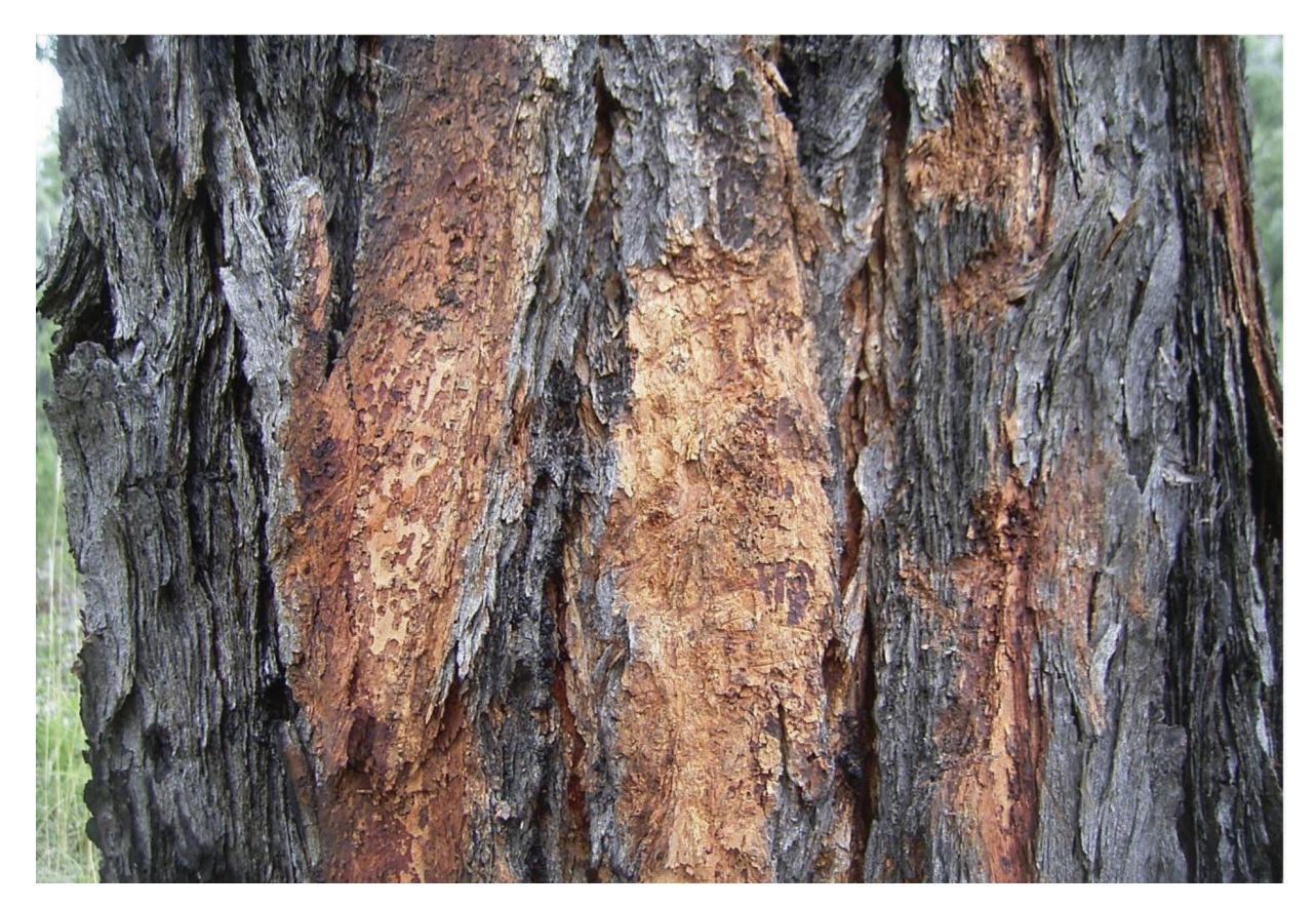
Fig. 7. Bark of Eucalyptus calidissima , showing layered grey-black outer bark (partly artificially removed revealing yellowish inner-bark).

calyptra, and barrel-shaped fruit. Eucalyptus paedoglauca , also from northern Queensland, bears similarities to E. calidissima in juvenile leaf and fruit morphology, but the glaucous trait on branchlets is short-lived and buds are non-glaucous (Slee et al. 2015).