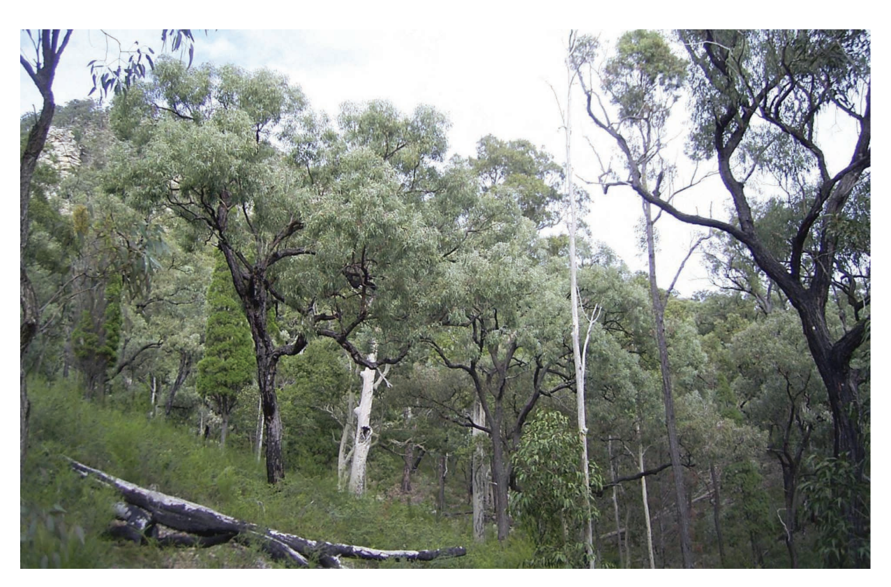
Fig. 2. Mature Eucalyptus calidissima trees, on moderately sloping foot slope of the Broken Back Range, showing greygreen canopy.

Illustrations: As Eucalyptus sp. Pokolbin, on page 96 of Eucalypts of the Sydney Region (Klaphake 2010) and page 77 of Endemic Plants of the Hunter: Trees and Larger Shrubs (Bell et al. 2019).