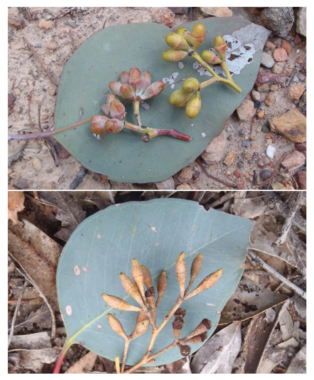
Fig. 5. Upper: Eucalyptus calidissima buds (fresh, showing variation in glaucous trait) and juvenile leaf (Pokolbin SF type location). Lower: Eucalyptus nubilis buds (dried) and juvenile leaf (Goonoo State Conservation Area, between Dubbo and Mendoran).