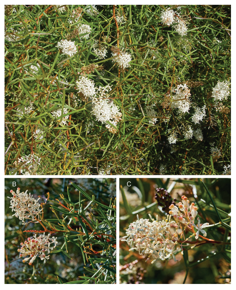
Fig. 1. Grevillea merceri . A. Dense flowering branchlets and leaves. B. Flowering branchlet. C. Close-up of conflorescence.