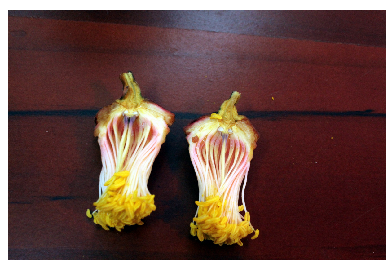
Fig. 5. Longitudinal section of adult flowers Camellia hongiaoensis , showing stamens, with sepals and petals removed (G. Orel & A. S. Curry OC36).

It should be noted that C. hongiaoensis was recently publicized in popular literature (Anonymous 3 November 2013) under misapplied name of C. krempfii (Gagnep.) Sealy. Detailed morphological studies which compared the descriptors of C. krempfii (Gagnepain 1941; Sealy 1958; Chang and Bartholomew1984; Ho 1991) and C. hongiaoensis indicate a number of morphological differences (refer to Table 1).