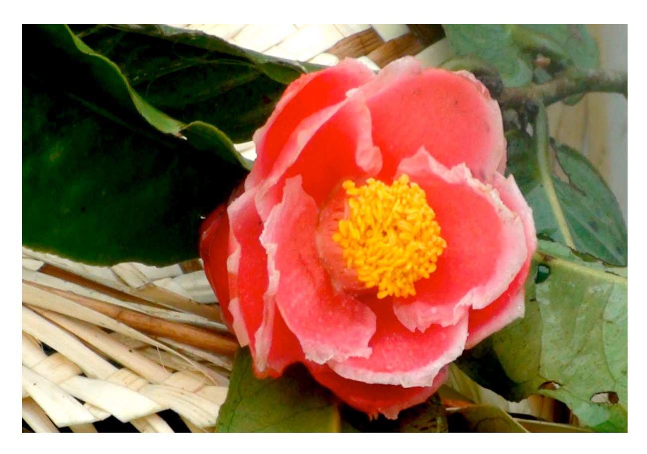
Fig. 3. Open adult flower of Camellia hongiaoensis showing petals and stamens ( G. Orel & A. S. Curry OC36 ).

102 Telopea 17: 99–105, 2014 Orel & Curry