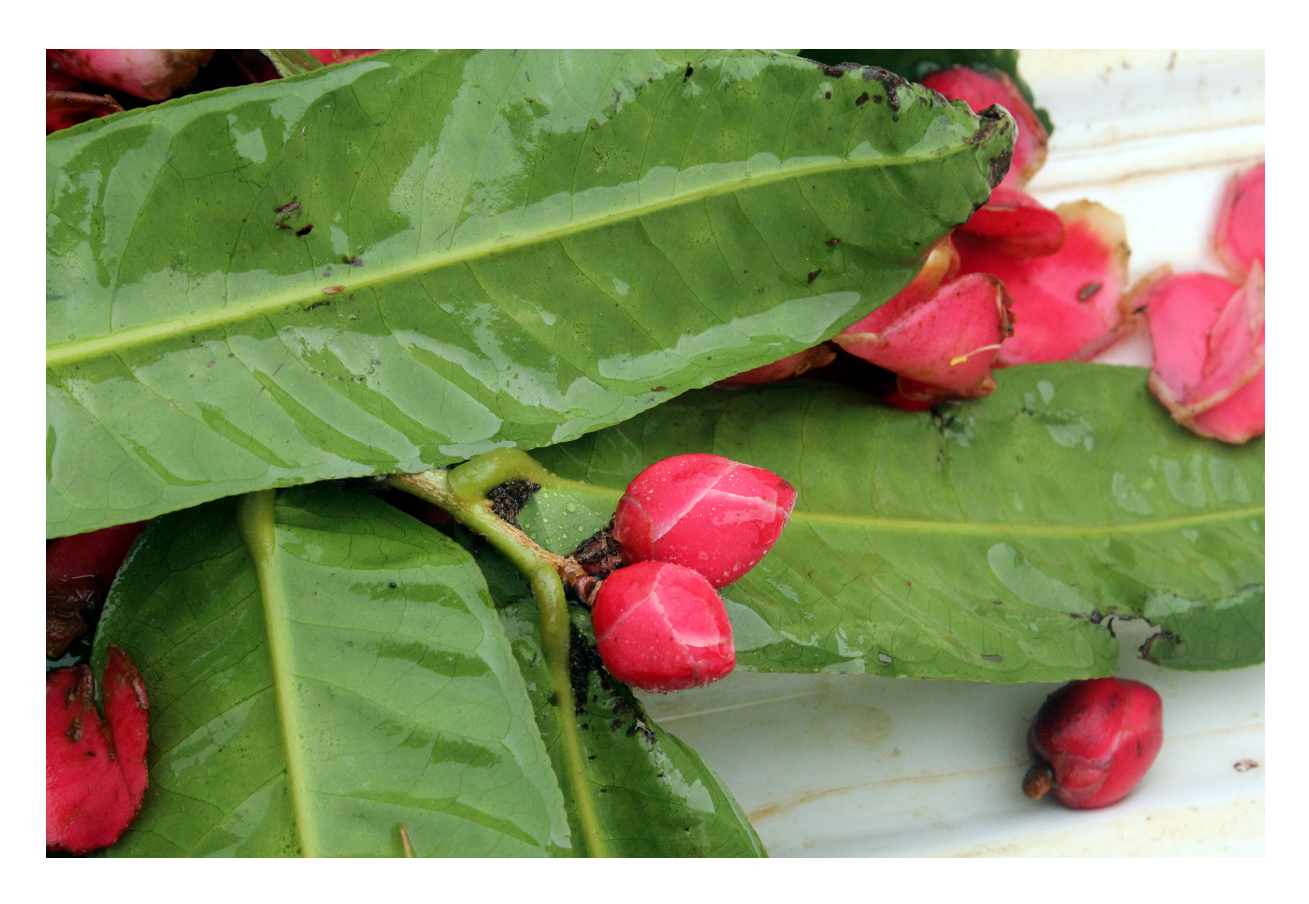
Fig. 1. Adult leaves and flower buds of Camellia hongiaoensis (G. Orel & A.S. Curry OC36).

100 Telopea 17: 99–105, 2014 Orel & Curry