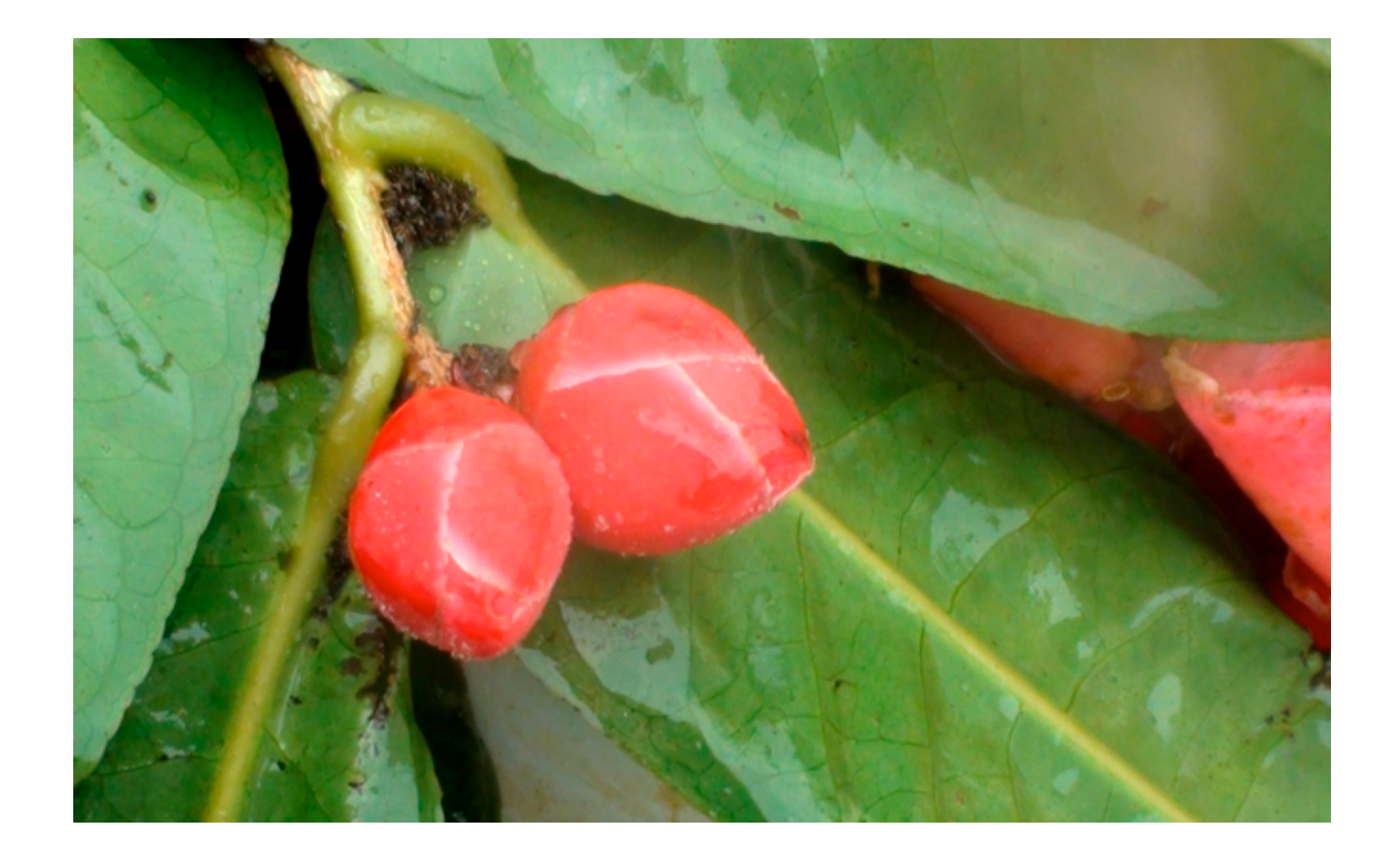
Fig. 2. Developing flower buds of Camellia hongiaoensis (G. Orel & A. S. Curry OC36). Image: G. Orel