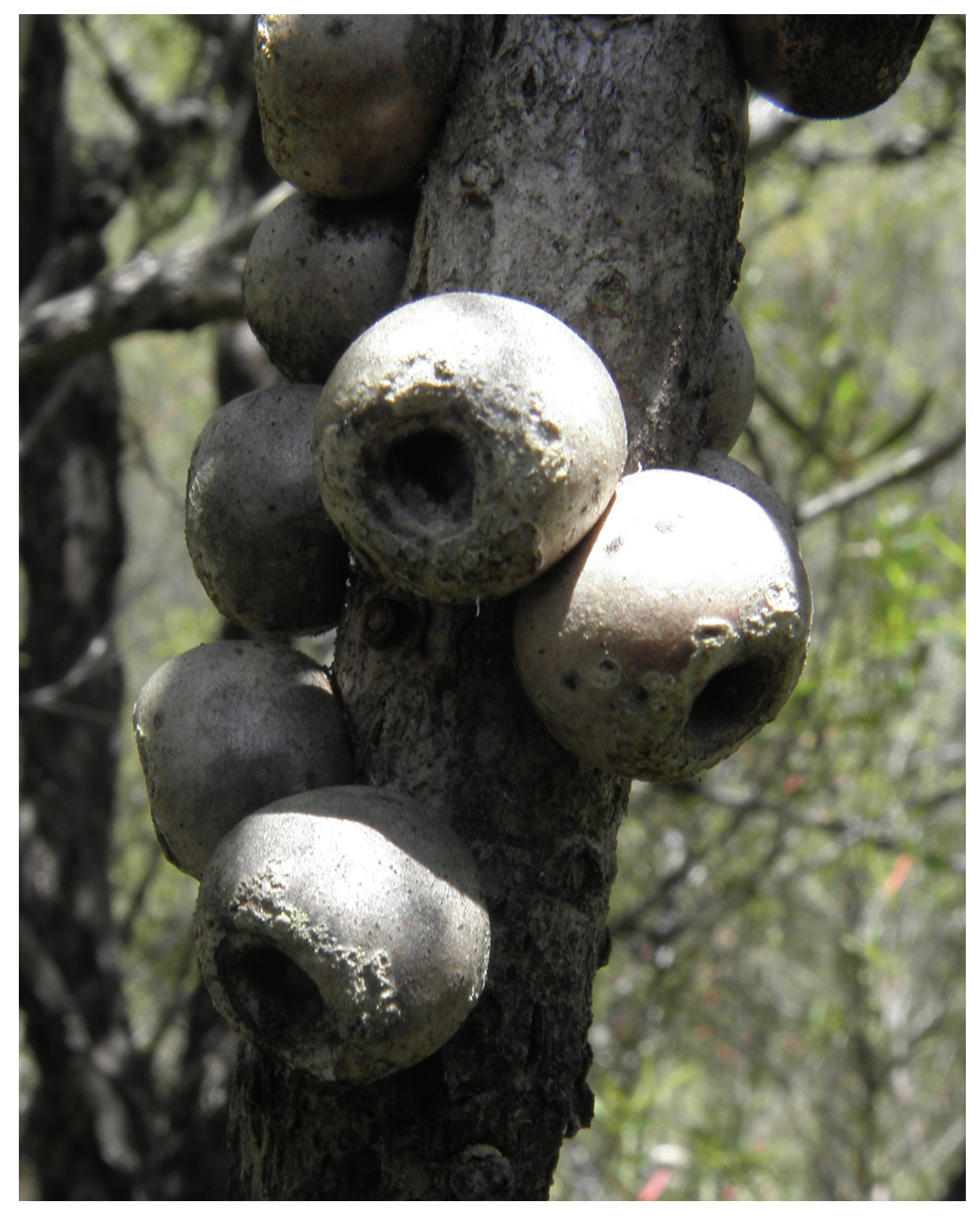
Fig. 2 Callistemon purpurascens, showing mature fruits with characteristically narrow aperture relative to fruit diameter