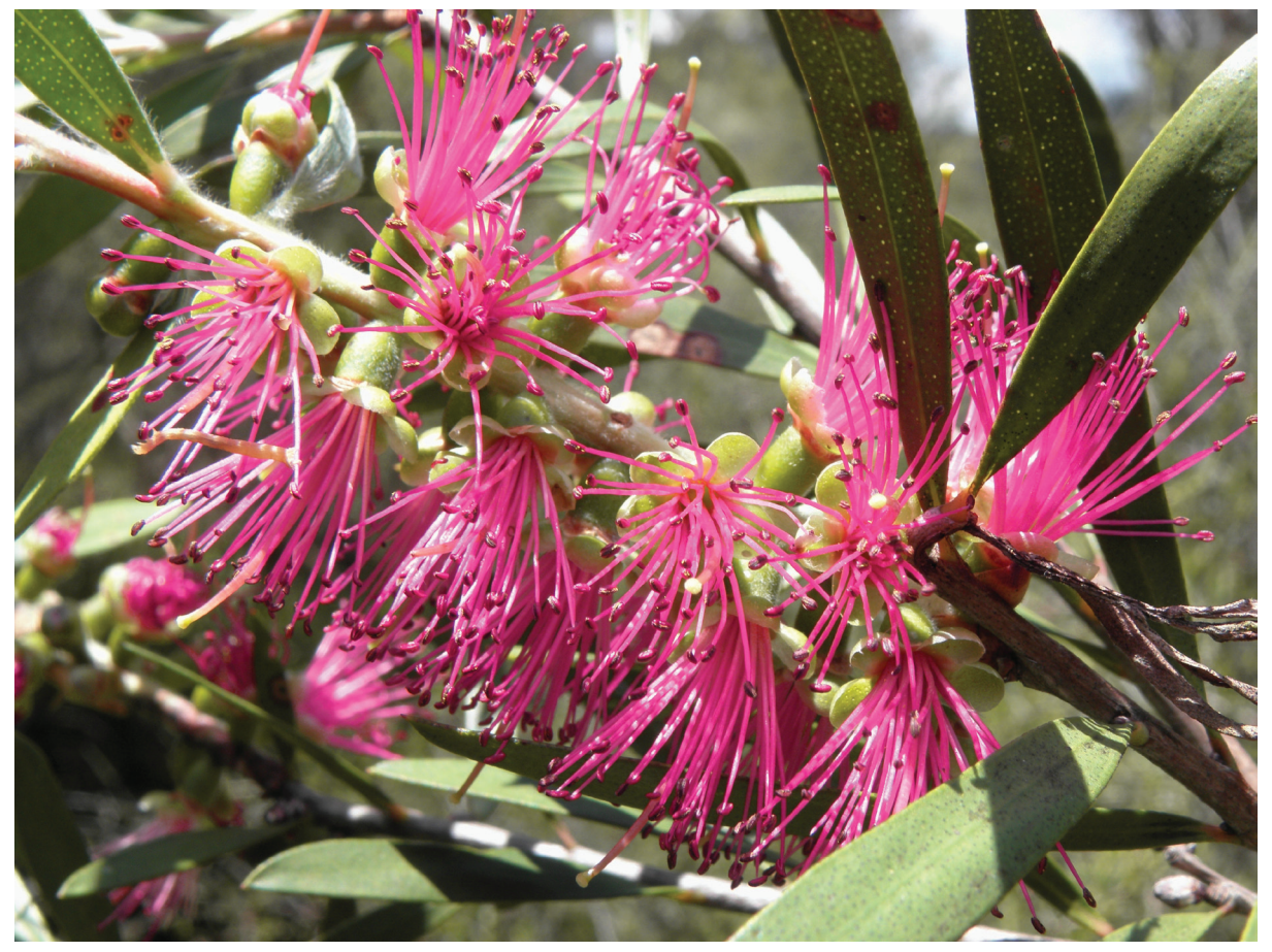
Fig. 1. Callistemon purpurascens , showing leaves and inflorescence, with pale green sepals, drying brown, and purplish stamens.

The fruits of C. purpurascens are more globose and have a relatively narrower aperture for their size when compared to the more barrel-shaped, wider-aperture fruits of C. citrinus . This is the most reliable distinguishing characteristic between these two species (Figs 2, 4). In addition, the leaves of C. purpurascens are generally longer and wider than those of the local forms of C. citrinus (Fig. 3).