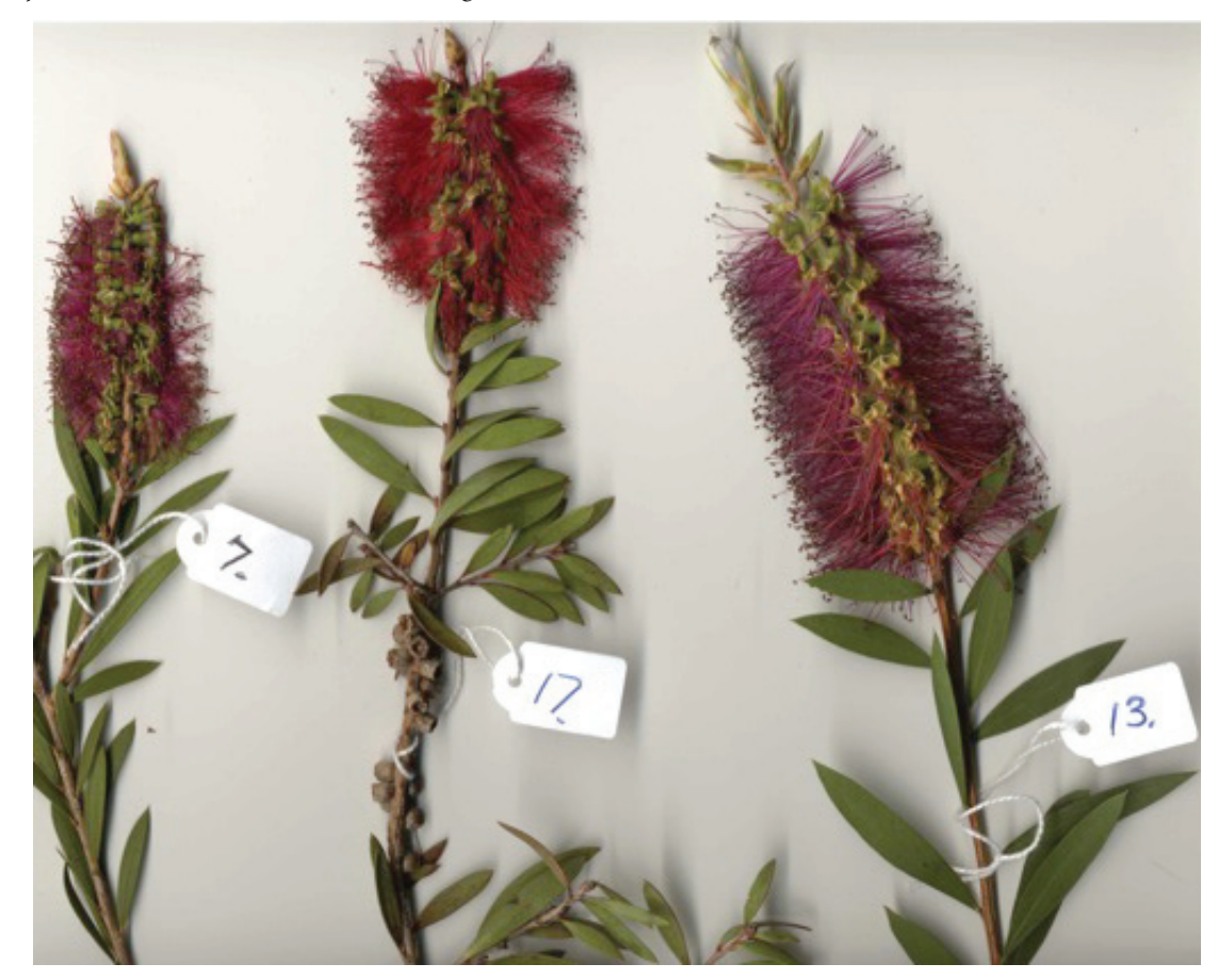
Fig. 4. Comparison of inflorescences and leaves of Callistemon species. Specimen tagged 7 is Callistemon megalongensis with the narrowest inflorescence and narrowest leaves that are also the most pungent-pointed; specimen 17 is C. citrinus with wider inflorescence and wider leaves than C. megalongensis ; specimen 13 is C. purpurascens with the widest and longest inflorescence and leaves.