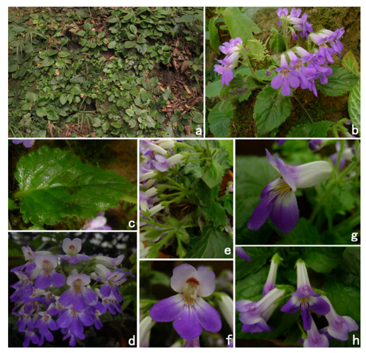
Fig.2 Primulina linglingensis (W.T.Wang) Mich.Möller & A.Weber var. fragrans F.Wen, Y.Z.Ge & B.Pan. a, Habitat; b, plant in flowering; c, adaxial surface of leaf blade; d, cyme and flowers; e, calyx lobes; f, frontal view of corolla; g, lateral view of corolla; h, top view of corolla.

Holotype: China. Guangxi Province: Quanzhou County, Huangsha Town, 26°03'N, 111°13'E, alt. ± 169 m, 09 Apr 2013, Bo Pan 130409-01 (flowering) (IBK).