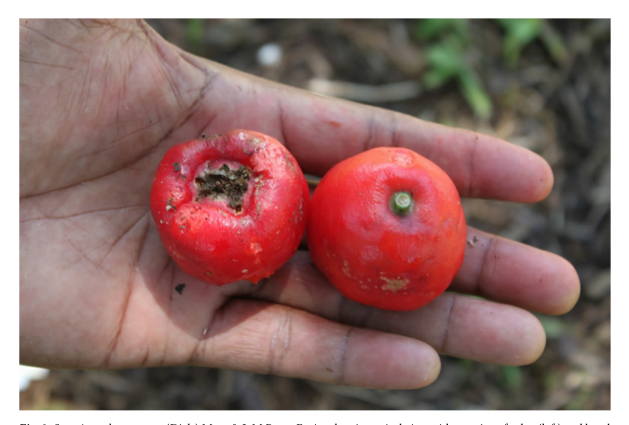
Fig. 3. Syzygium platycarpum (Diels) Merr. & L.M.Perry. Fruits, showing apical view with remains of calyx (left) and basal view with distal remains of pedicel (right).

Syzygium lababiense B.J.Conn & K.Q.Damas sp. nov.