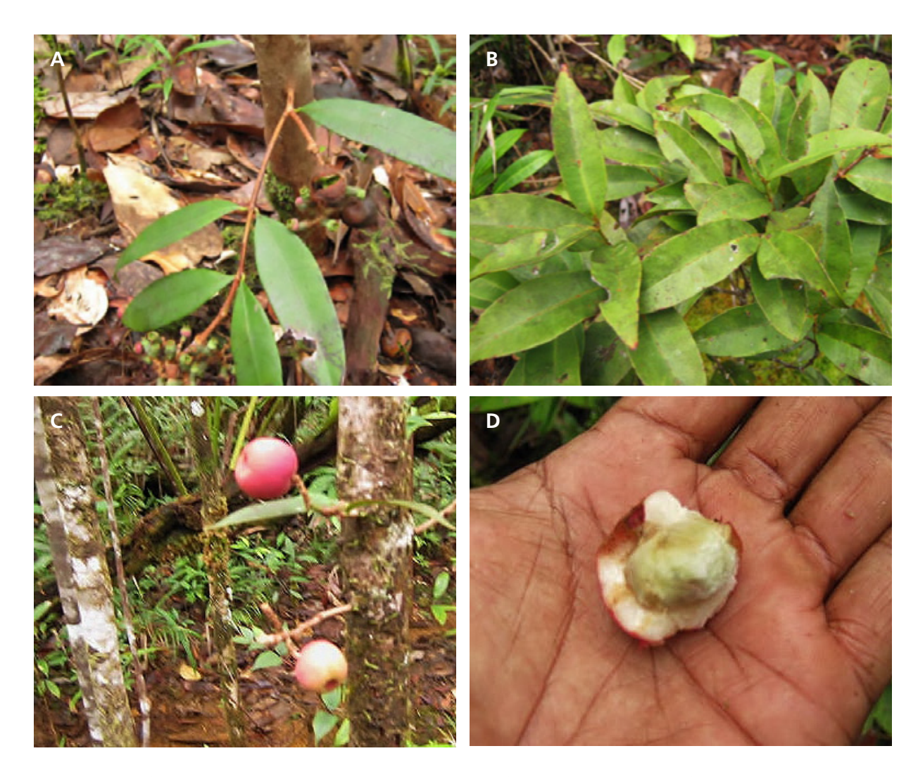
Fig. 6. Syzygium kuiense B.J.Conn & K.Q.Damas. A. leaves near base of young sapling; B. details of leaves, showing the indistinct (faint) secondary veins; C. cauliflorous fruits; D. seed exposed after some of fruit wall removed.

Syzygium cravenii B.J.Conn & K.Q.Damas sp. nov.