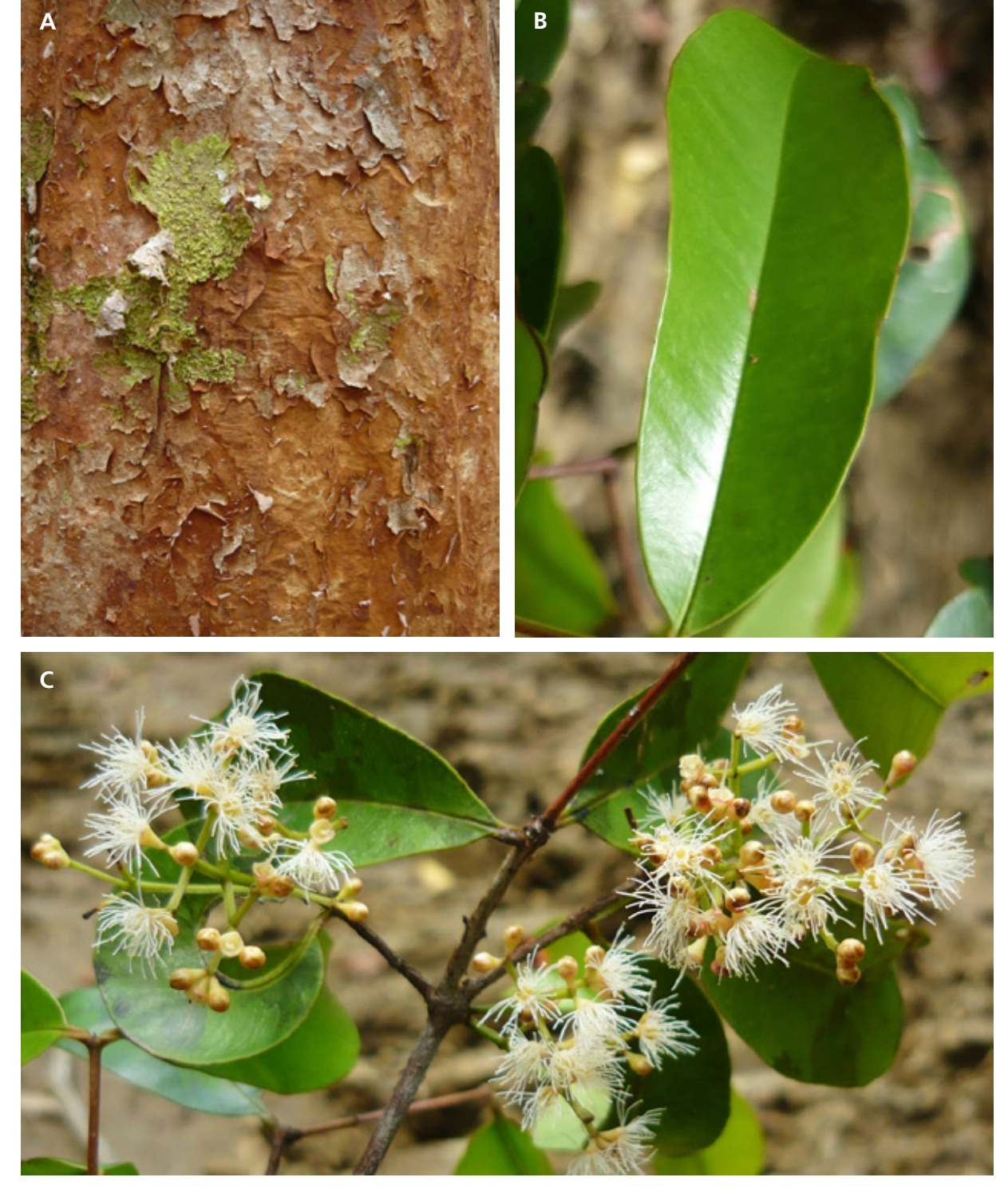
Fig. 7. Syzygium cravenii B.J.Conn & K.Q.Damas. A. basal section of trunk showing rough papery, peeling outer bark; B. details of leaves, showing the indistinct (faint) secondary veins; C. flowering branchlets showing axillary inflorescence and flowers.

Notes: This minor hardwood species is only known from the type collection.