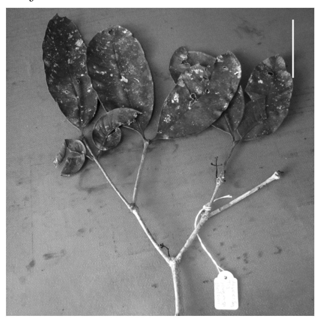
Fig. 1. Syzygium pterotum. Herbarium collection ( Damas LAE79730 ) showing a branchlets with leaves and two old inflorescences with the remains of the flowers. Scale bar: 5 cm

Canopy trees, up to 20 m high; bole cylindrical, up to 30 cm diam., straight, up to 10 m long; buttresses absent, or if present, then short. Bark grey or brown, rough, scaly or flaky or peeling; lenticels irregular; bark <25 mm thick; under-bark pink or grey; blaze strongly aromatic, pleasant; consisting of one layer, white or yellow, fibrous; exudate colourless, not readily flowing, changing to purple or grey on exposure to air, not sticky. Branchlets 4-angled, soon becoming slightly flattened to more or less terete. Leaves spaced along branches; petiole 8–10 mm long, not winged, not swollen; lamina elliptic to narrowly elliptic, 13–18 cm long, 5.5–7.5 cm wide; base cuneate, margin flat, apex acuminate, venation pinnate, secondary veins open, 12–15 on each side of mid vein, prominent, angle of divergence from mid vein 28–30(–35)°; tertiary veins indistinct; intramarginal vein 1, distinct, 1–1.5 mm from lamina margin; lower surface blue-green, upper surface dark green, hairs absent, oil glands not visible (to unaided eye). Inflorescence axillary, branched (3-flowered); peduncles c. 5 mm long, shortly winged (wings c. 0.2 mm wide), hence appearing quadrangular in cross-section; pedicel c. 1 mm long; bracteoles not seen; only old flowers seen (shape and size not measurable); base of staminal filaments persistent, many. Fruits sub-ellipsoidal, 20–30 mm long, 15–20 mm diam., fleshy. Seeds 1, up to 30 mm, up to 15 mm wide. Fig. 1