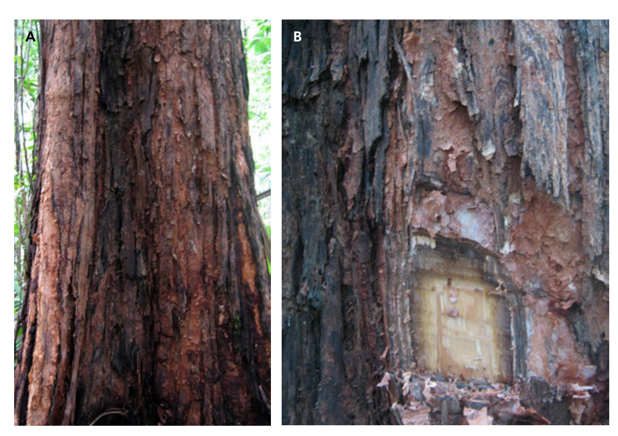
Fig. 4. Syzygium lababiense B.J.Conn & K.Q.Damas. A. basal section of trunk showing rough flaky, red-brown outer bark; B. outer bark with blaze showing single layered inner fibrous bark.

Notes: Syzygium lababiense is a minor hardwood species that is only known from the Kamiali area of the Morobe Province.