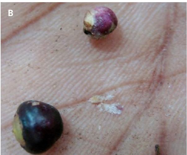
Fig. 5 Syzygium lababiense B.J.Conn & K.Q.Damas. A. fruiting branchlet showing leaves and purple fleshy fruits, showing leaves with indistinct (faint) secondary veins; B. close-up of fruit (left) and seed. Photo: K.D.Q. Damas.

Syzygium kuiense B.J.Conn & K.Q.Damas sp. nov.