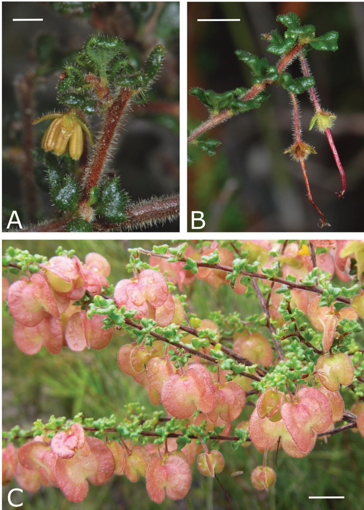
Fig. 4. Dodonaea hirsuta . A. male flower, from I.R. Telford 13177 & J.J.Bruhl; B. female flower, from I.R. Telford 13177 & J.J.Bruhl. C. fruit, photographed 9 Oct. 2010 at Bald Rock Creek, Girraween National Park, Qld. Scale bars: A=2 mm; B=5 mm; C=10 mm. Images by J.J. Bruhl.