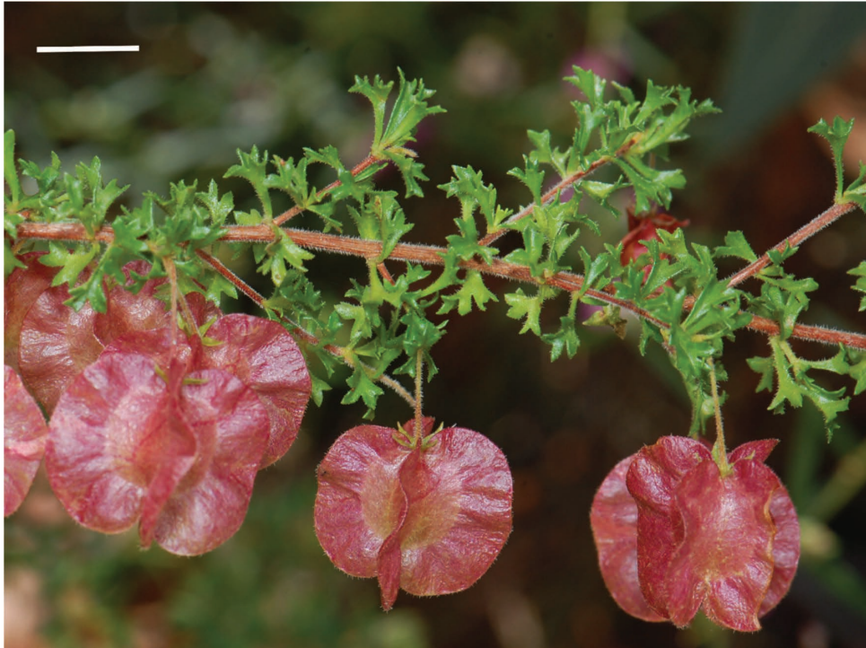
Fig. 2. Dodonaea crucifolia . Fruiting stem, from I.R.Telford 13242 et al. (type gathering). Scale bar=10 mm.

The Kangaroo Creek and Grafton Sandstones define an important area of endemism, the restricted species (several gazetted as endangered, several undescribed) often occurring sympatrically on rocky sites. Taxa include Hibbertia acuminata , Grevillea banyabba , Prostanthera sejuncta , Angophora robur , Eucalyptus psammitica , E. pachycalyx subsp. banyabba , Homoranthus floydii , Melichrus sp. Newfoundland State Forest (P.Gilmour 7852), Boronia chartacea , B. hapalophylla , Philotheca papillata , Bursaria cayzeriae , Bertya sp. Chambigne Nature Reserve (M.Fatemi 24), Lasiopetalum sp. Glenreagh (J.B.Williams NE36942). Also occurring here are the northern disjunct populations of Doryanthes excelsa .