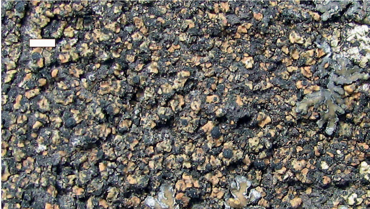
Fig. 3. Monerolechia papuensis (holotype). Scale bar = 2 mm.