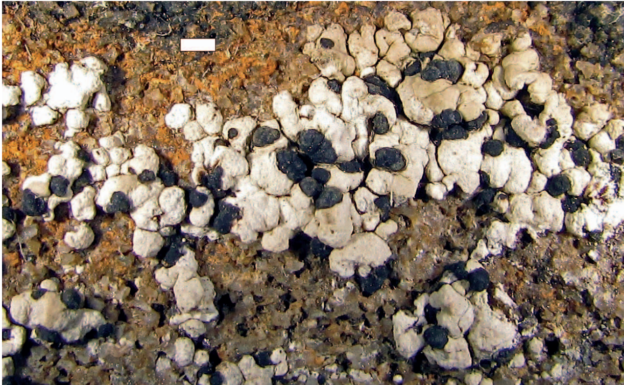
Fig. 5. Buellia maunakeansis ( Elix 10351 in CANB). Scale bar = 1 mm.

United States of America: Hawai'i: Oahu, Kailua Beach Reserve, 21°24'N, 157°44'W, alt. 2 m, on volcanic rocks along the foreshore, J.A. Elix 13517 , 9 Jul 1983 (CANB).