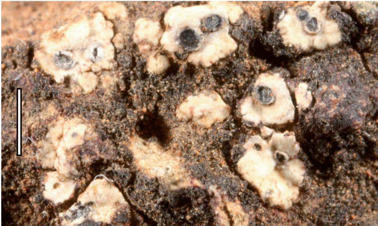
Fig. 1. Buellia rarotongensis (holotype). Scale bar = 1 mm.