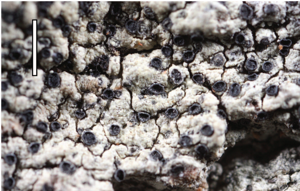
Fig. 2. Gassicurtia albomarginata (holotype). Scale bar = 1 mm.

Distribution and habitat: At present, this new species is known only from the type locality. Associated species included Graphis ceylanica Zahlbr., G. subserpentina Nyl., Leiorreuma exaltatum (Mont. & Bosch) Staiger, Parmotrema neocaledonicum (Nyl.) Elix, P. saccatilobum (Taylor) Hale, P. tinctorum (Despr. ex Nyl.) Hale and Thecaria montagnei (Bosch) Staiger.